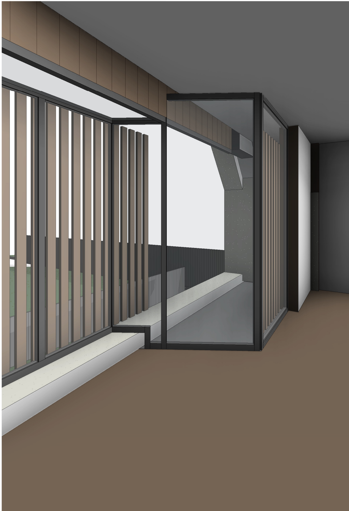
Outlook from Bedroom 4