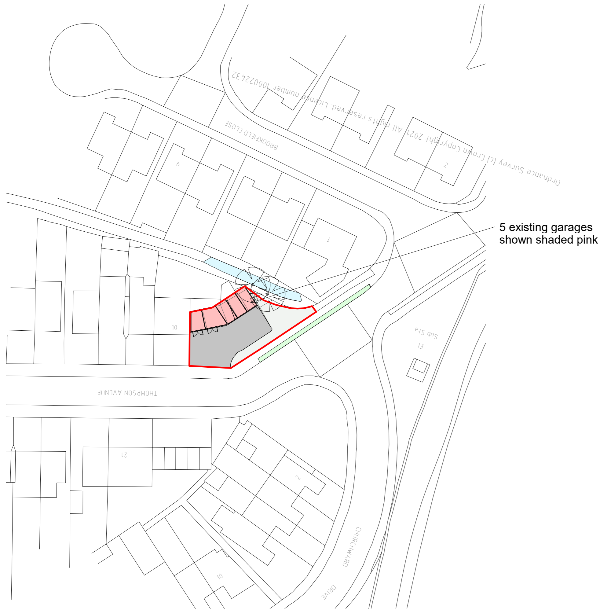
2 Site Project North 1 : 500