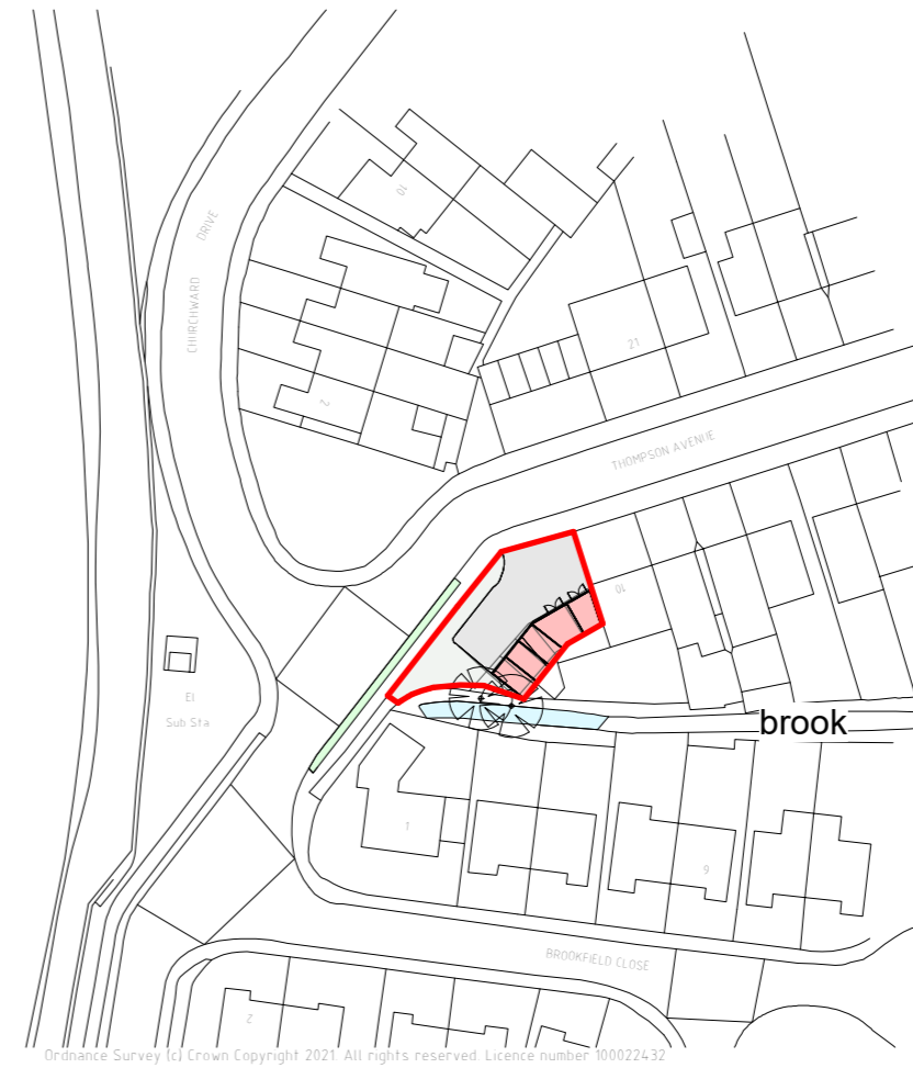
1 Site True North 1 : 1000