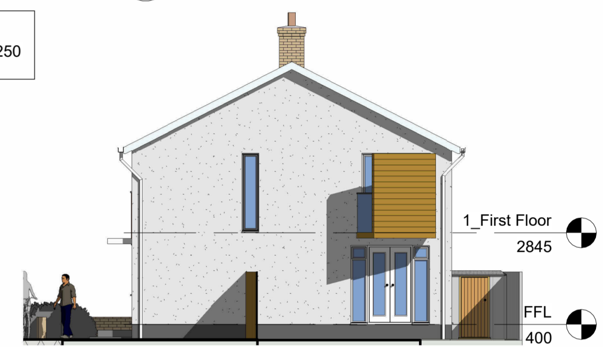
6 SIDE GARAGE 1 : 100

Bicycle Storage 3 off. Each one 1800 x 1200 x 1750h to have double doors and locked. Each to have Sheffield style rack 500 from back wall. External timber to match house