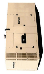
TYPICAL GENERATOR IMAGE