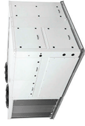
TYPICAL AIR HANDLING UNIT IMAGE