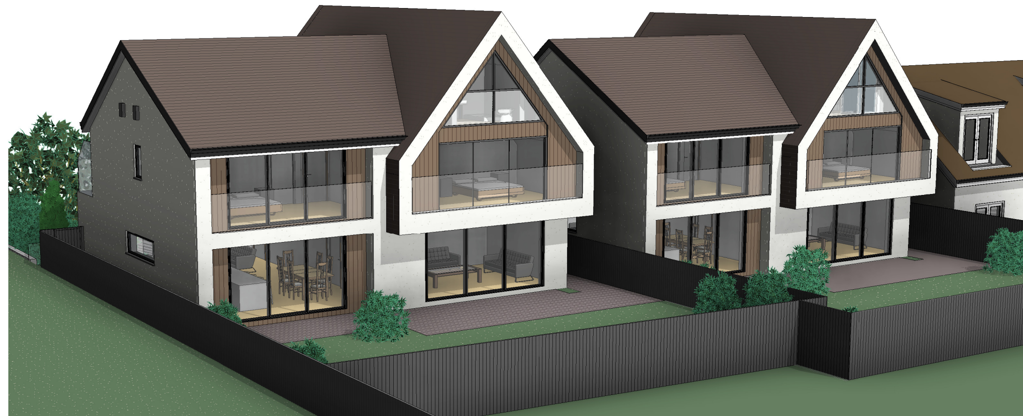
South West Perspective View