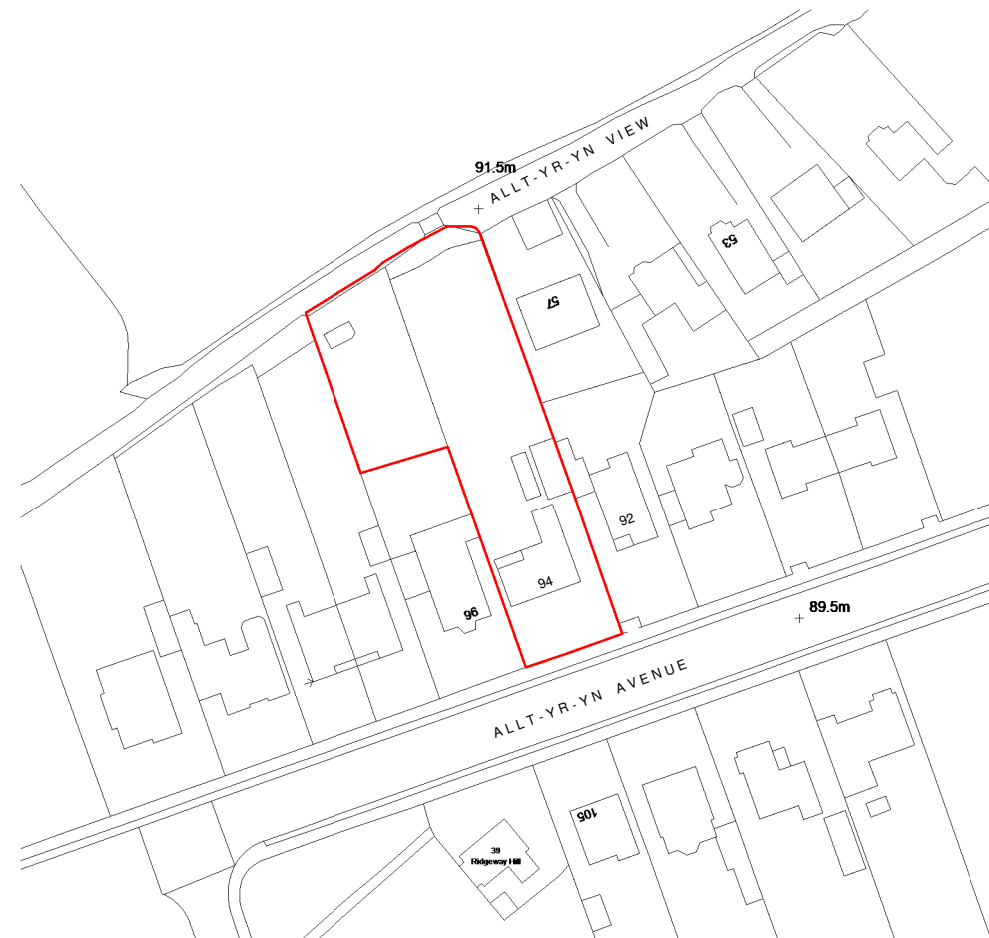
Location Plan 1 : 1250