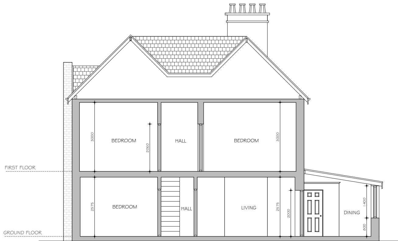
EXISTING SECTION A-A SCALE : 1 : 100