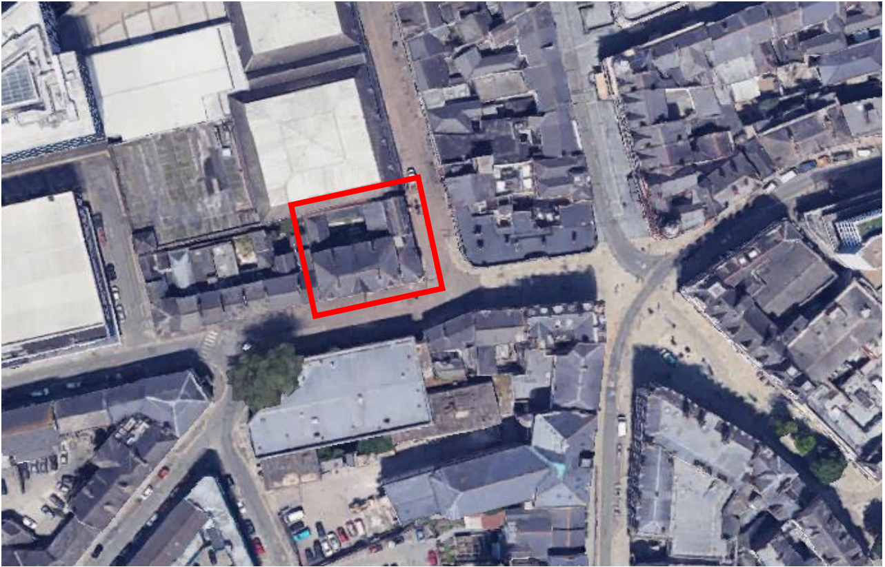
Appendix A: Locality of Project Area