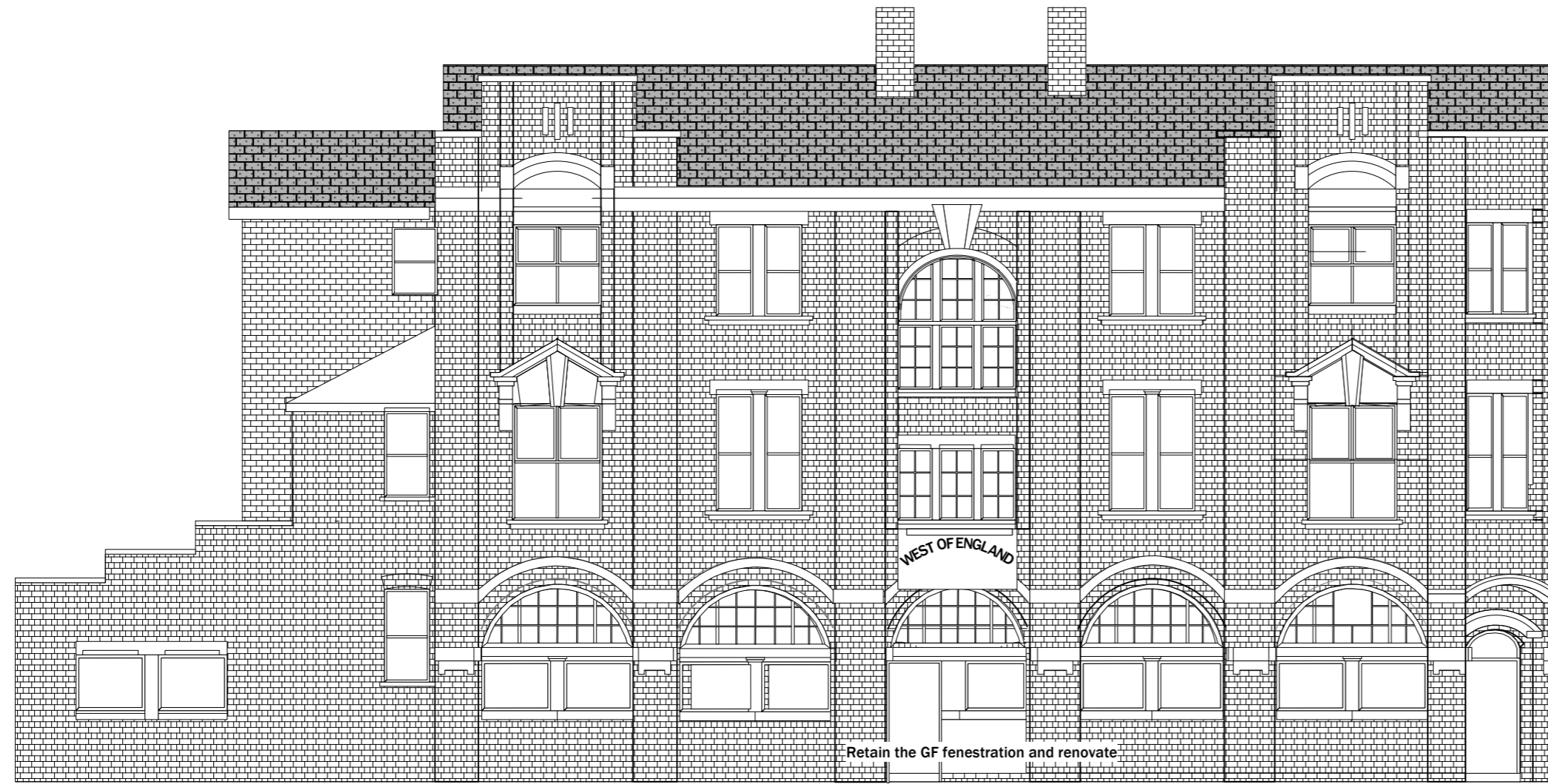
Existing Front Elevation new access door and entry system

All windows to apartments to have new double glazed windows with sound reduction of 33 Db