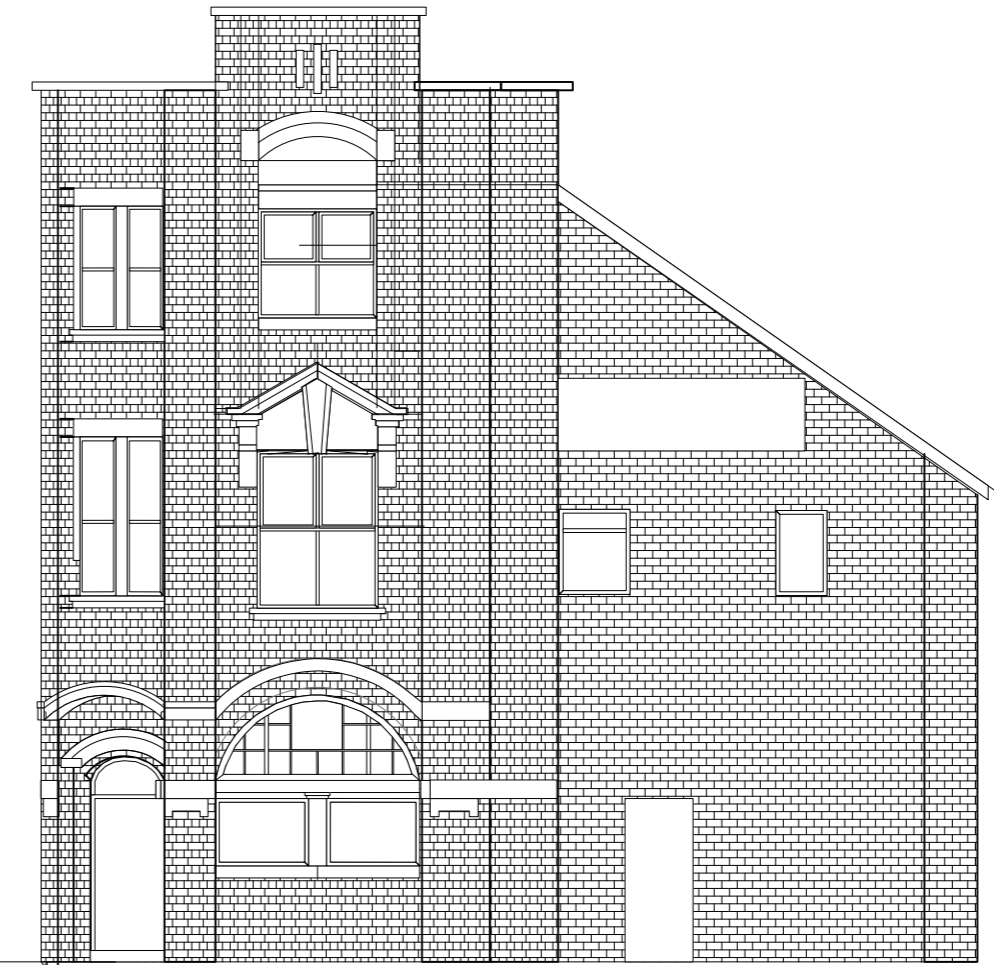
Existing Side Elevation( Mill Parade)