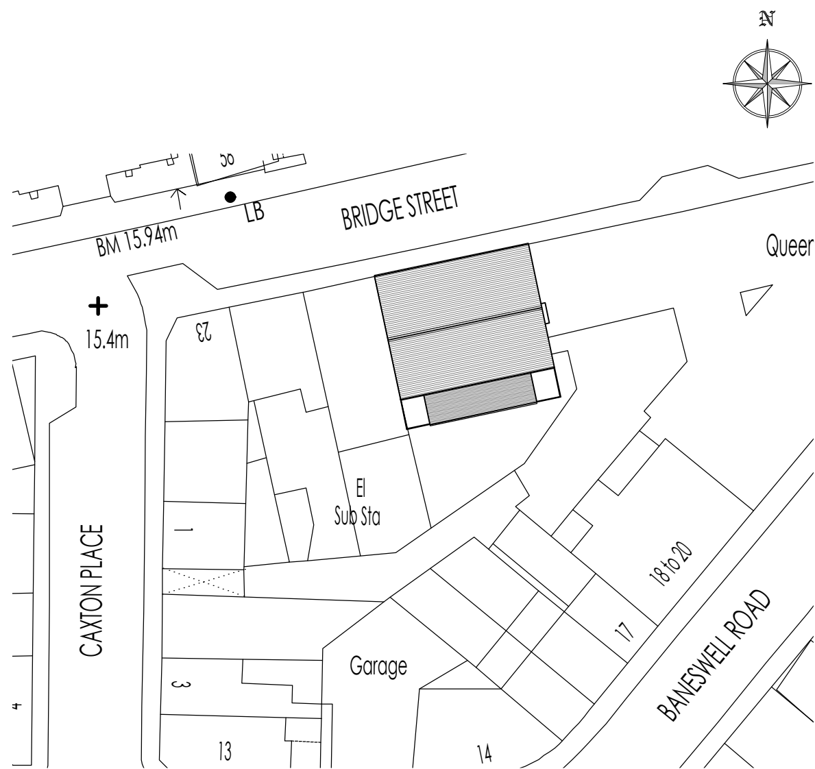
Proposed Site Block Plan 1:500