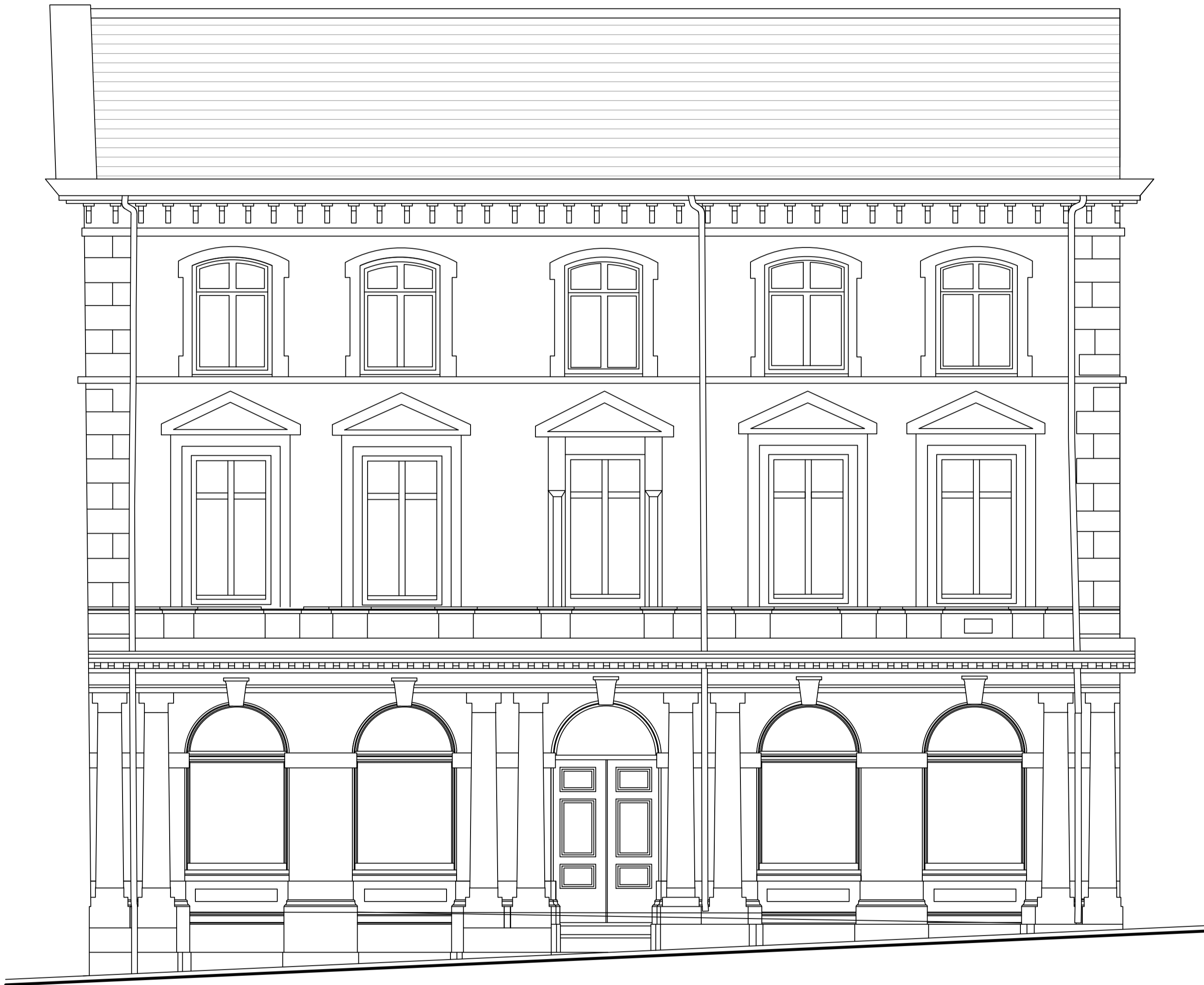
Front Elevation - 1:50

specification: The Contractor is to comply with current Building Legislation, British Standard Specifications, Building Regulations etc. whether or not specifically stated on this drawing. This drawing must be checked against and read in conjunction with any structural or other relevant specialist and design documentation provided.