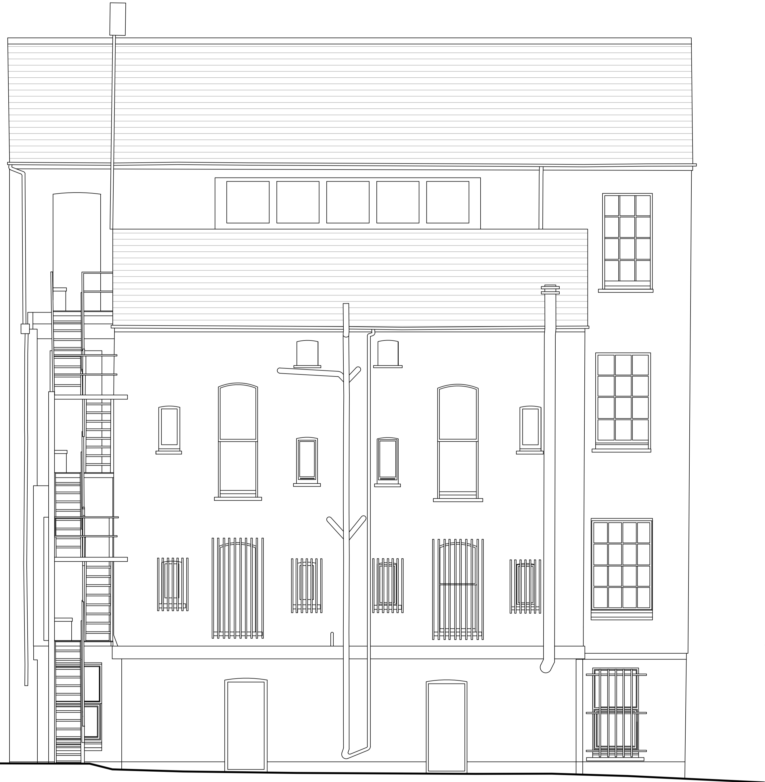
Rear Elevation - 1:50

specification: The Contractor is to comply with current Building Legislation, British Standard Specifications, Building Regulations etc. whether or not specifically stated on this drawing. This drawing must be checked against and read in conjunction with any structural or other relevant specialist and design documentation provided.