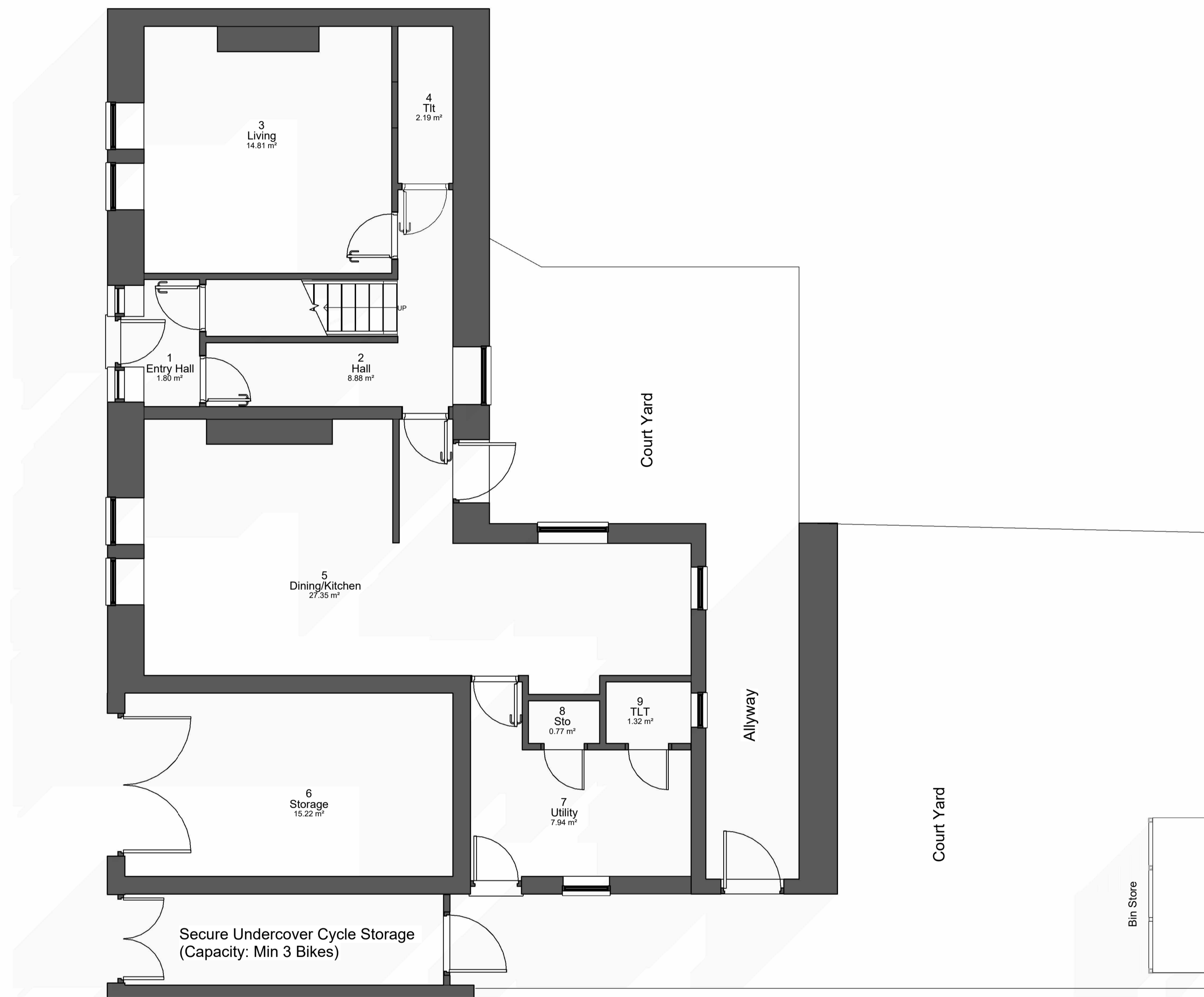
1 Proposed Ground Floor 1:50