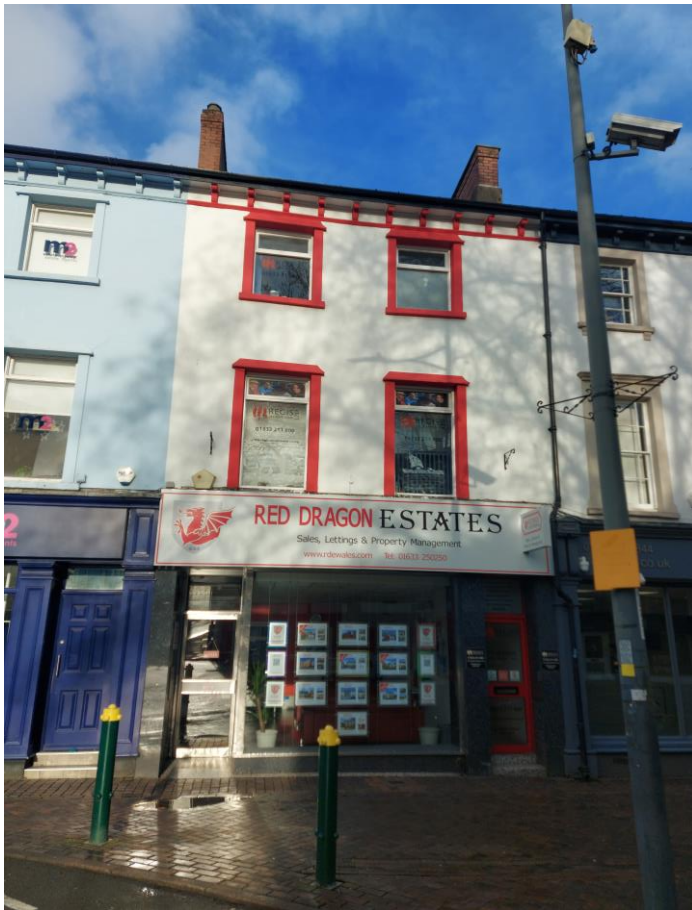
Plate 1 – Front Elevation