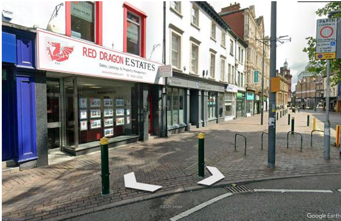
Plate 2 – Cycle Parking