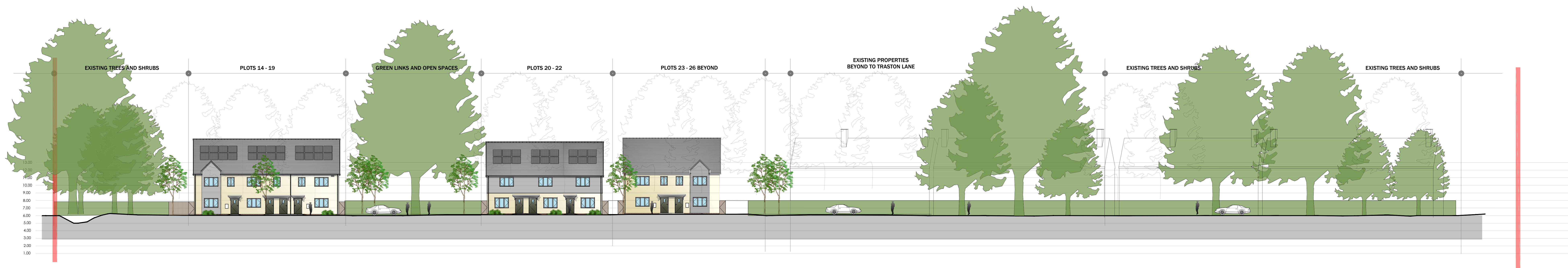
SITE SECTION 2