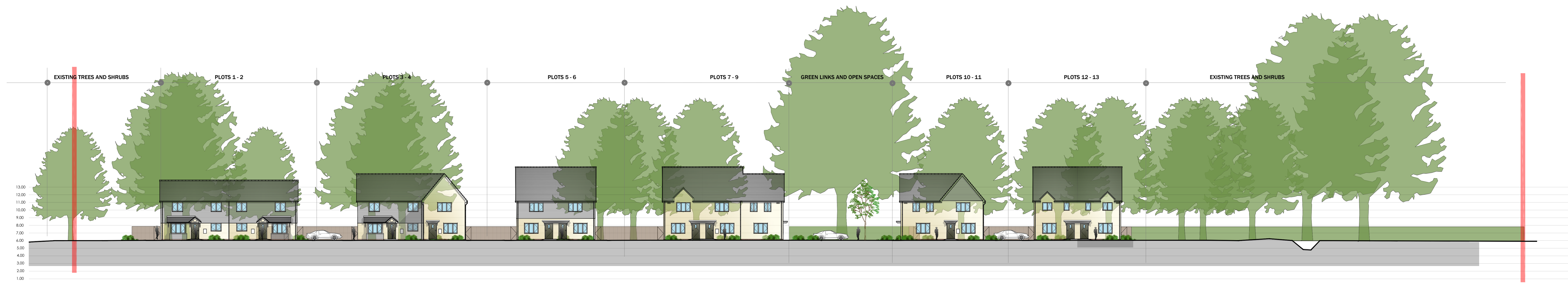
SITE SECTION 1

Do not scale from this drawing. The users of this drawing shall check all dimensions and details against the original drawings and specifications and shall be responsible for any errors or omissions. This drawing is copyright. It must not be reproduced, stored in a retrieval system, or transmitted in any form or by any means without prior permission of the author. Design