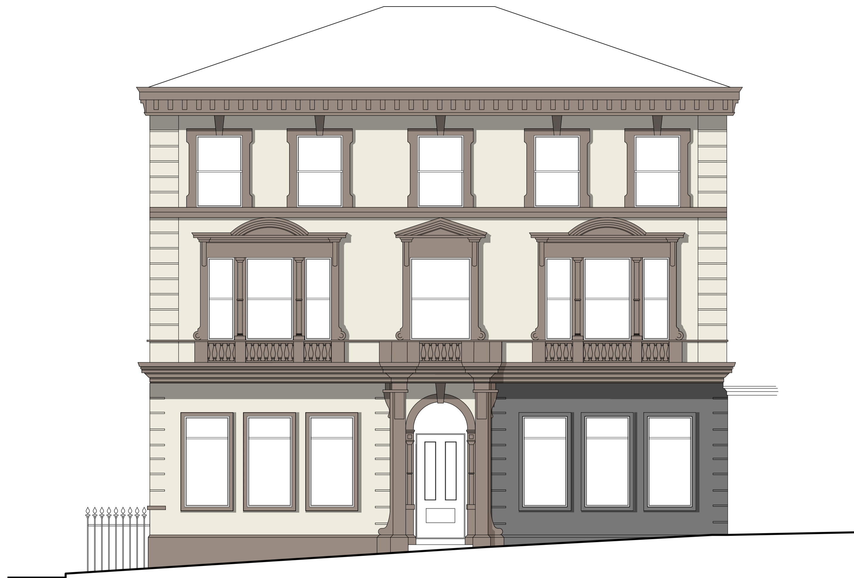
Existing Front Elevation - 1:50

specification: The Contractor is to comply with current Building Legislation, British Standard Specifications, Building Regulations etc. whether or not specifically stated on this drawing. This drawing must be checked against and read in conjunction with any structural or other relevant specialist and design documentation provided.