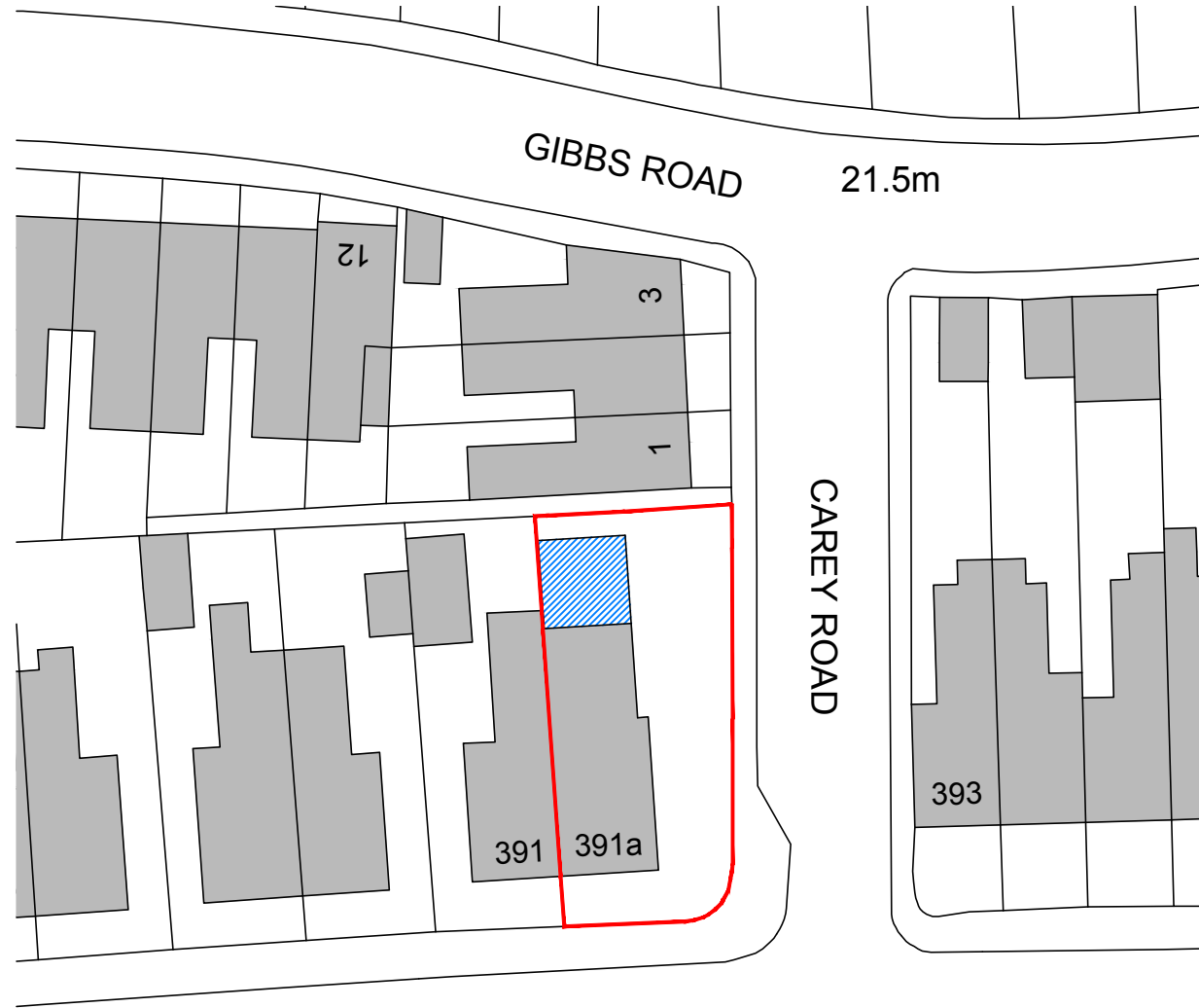
PROPOSED BLOCK PLAN 1:500 @ A3