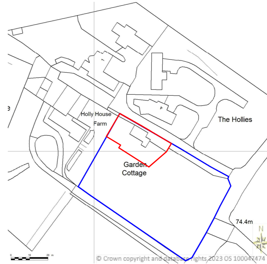
Existing Location Plan

SITE LOCATION PLAN AREA 2 HA SCALE: 1:1250 on A4 CENTRE COORDINATES: 325124 , 185910