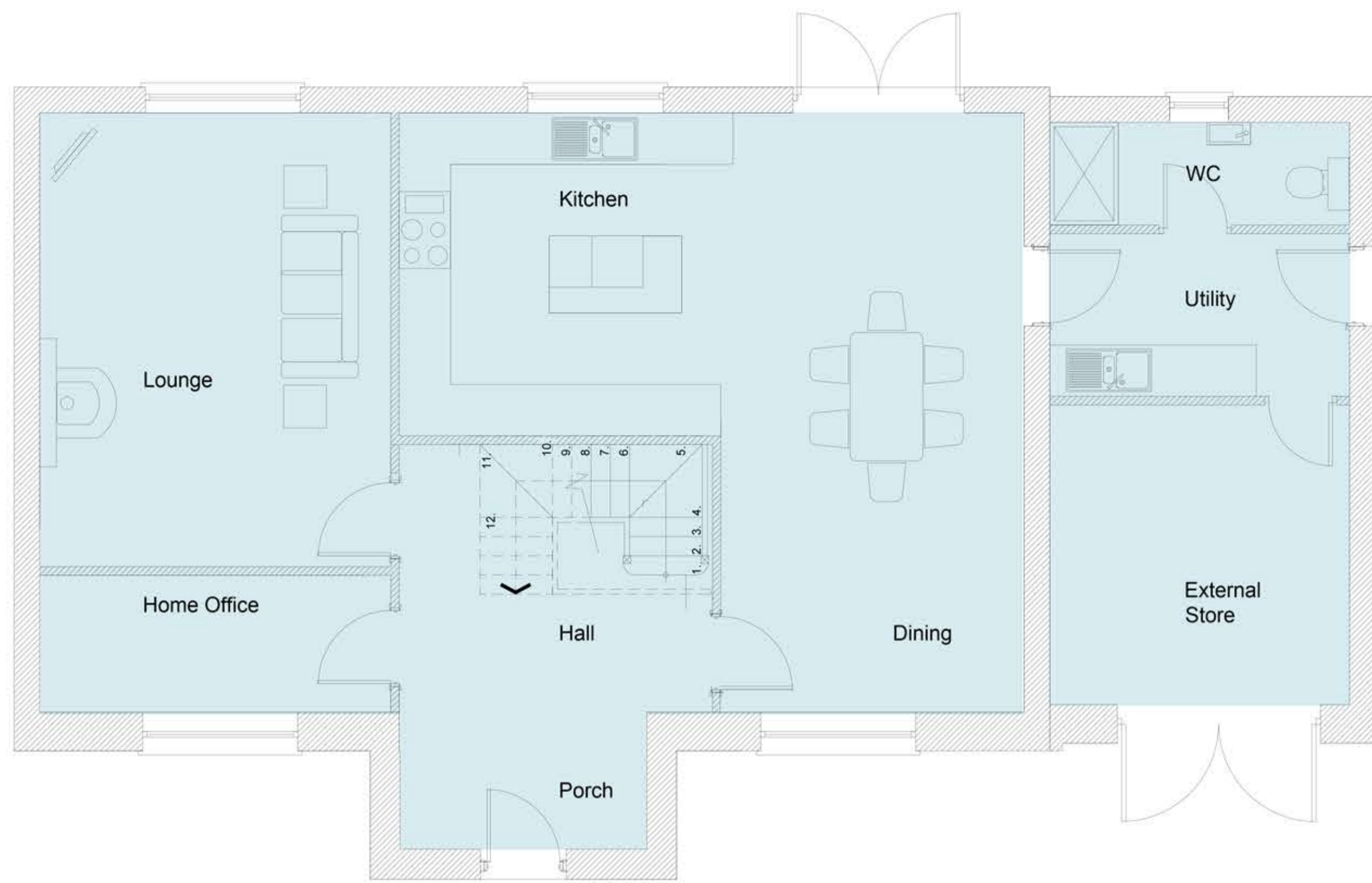
Ground Floor Plan as proposed 1:50 scale