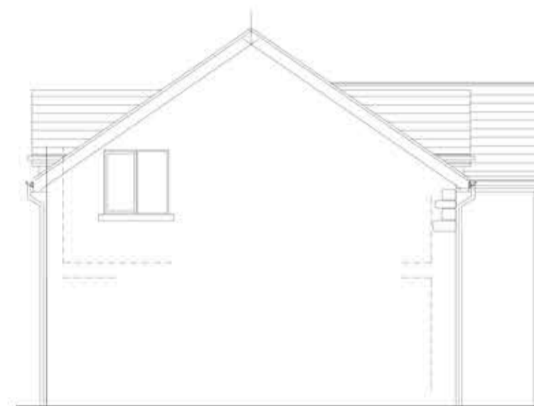
North East elevation as proposed 1:100 scale