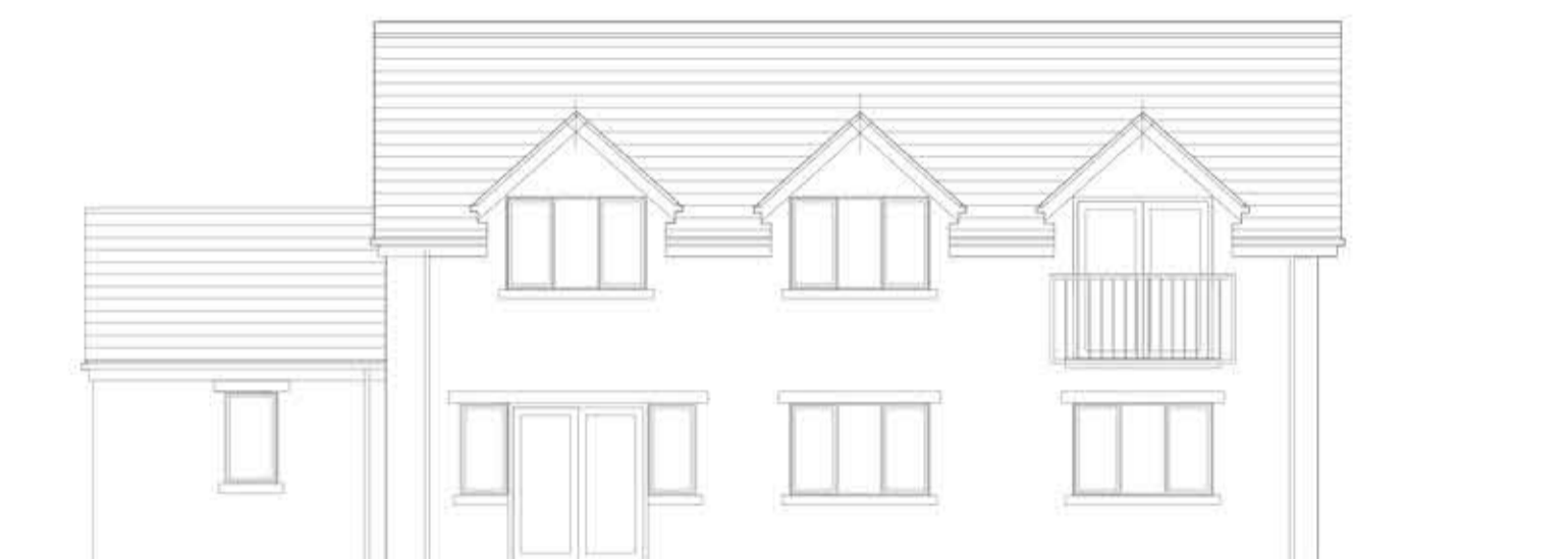
South East elevation as proposed 1:100 scale