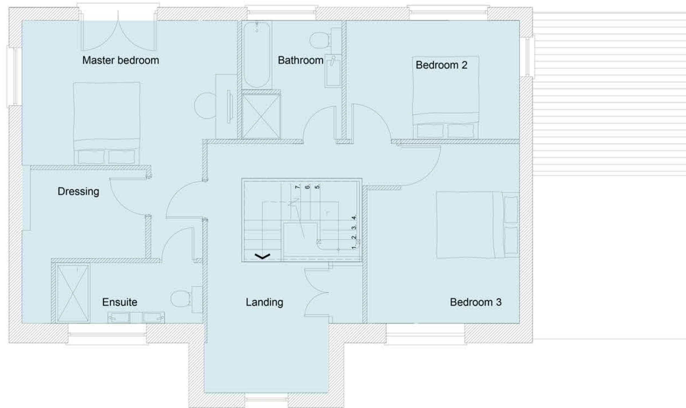
First Floor Plan as proposed 1:50 scale