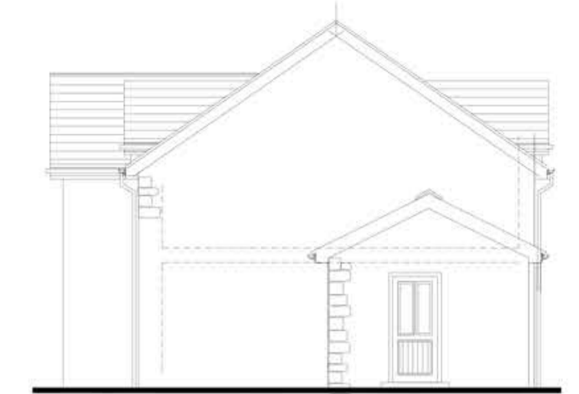
South West elevation as proposed 1:100 scale