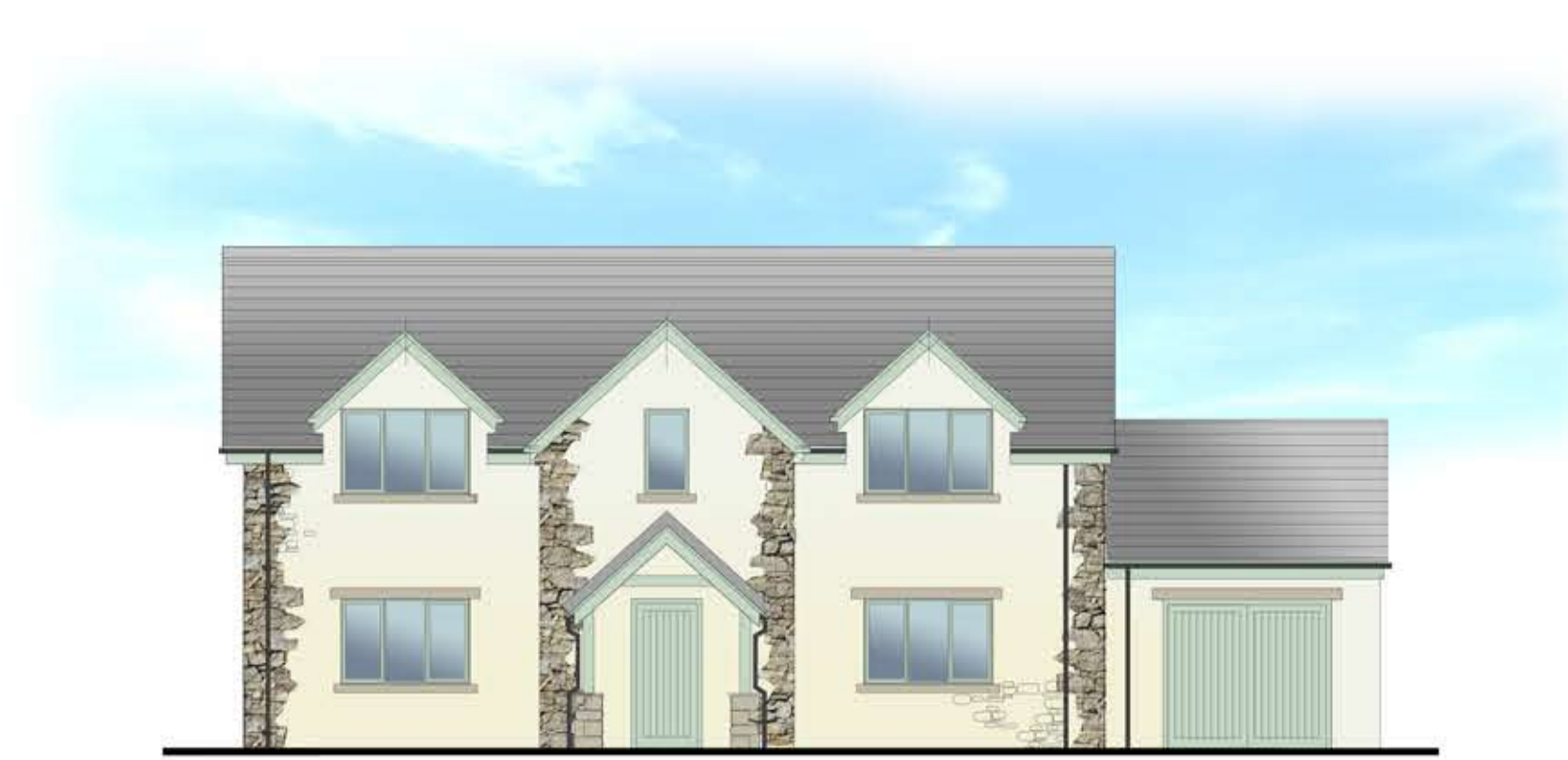
North West elevation as proposed 1:100 scale