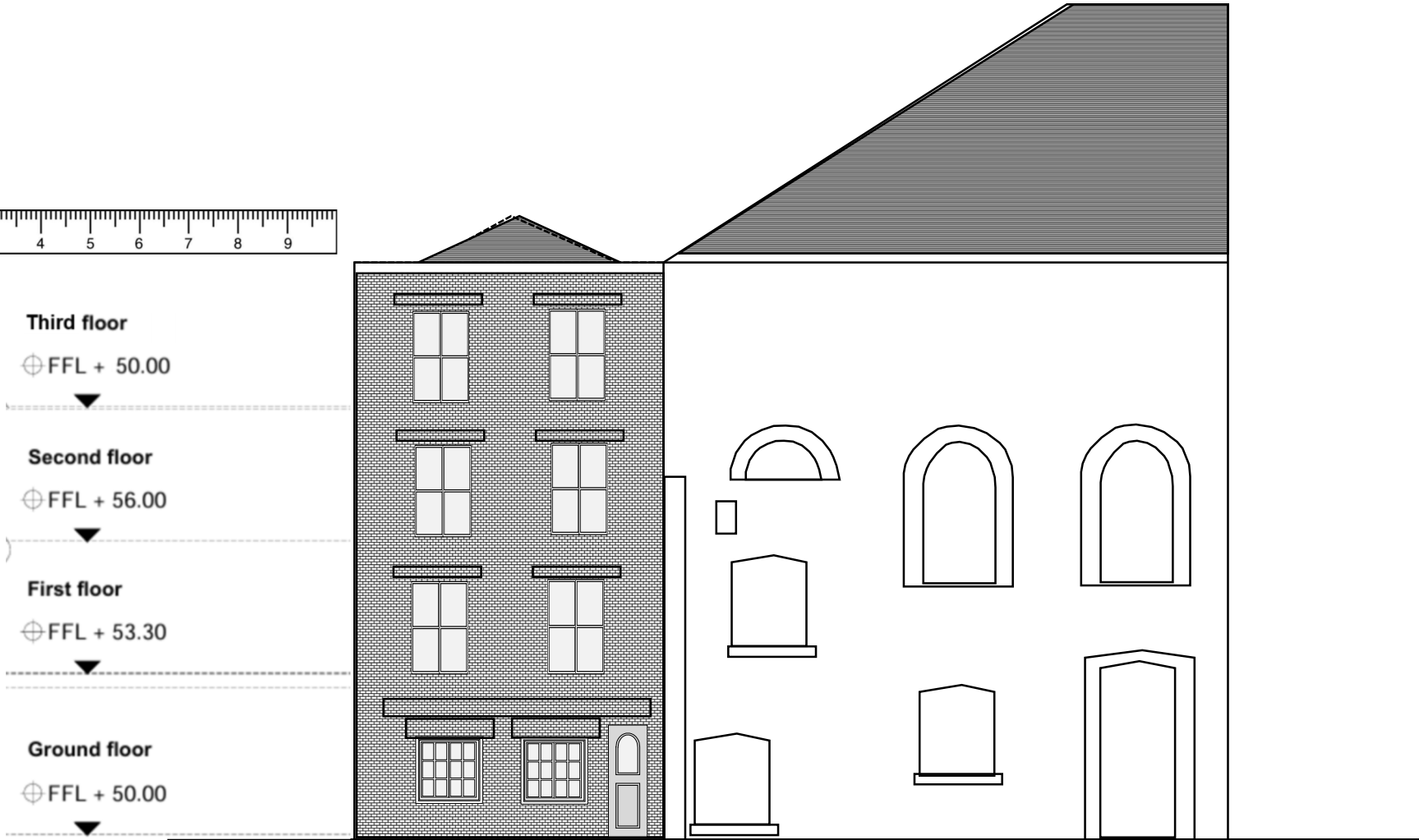
EXISTING FACADE RECONFIGURED