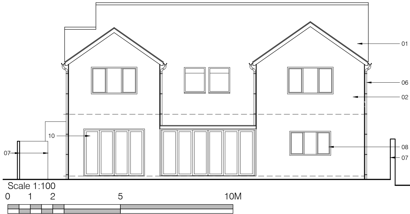
REAR (WEST) ELEVATION