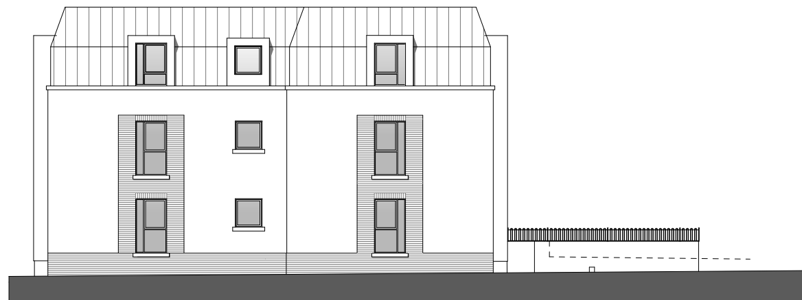
Elevation to Kelvedon Street ( South East Facing )

B : Revised to reflect floor plan revisions : 08 11 2024 A : Railings revised : 04 11 2024