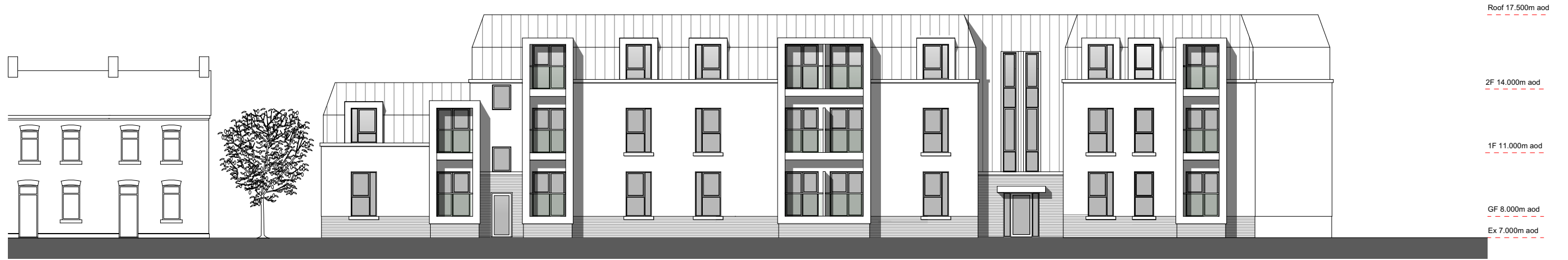
Elevation to Feering Street ( South West Facing )