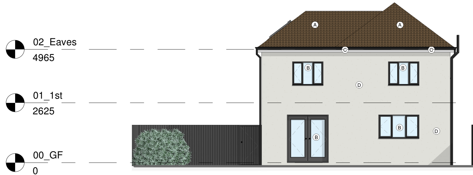
South East (Rear) Elevation 1 : 100