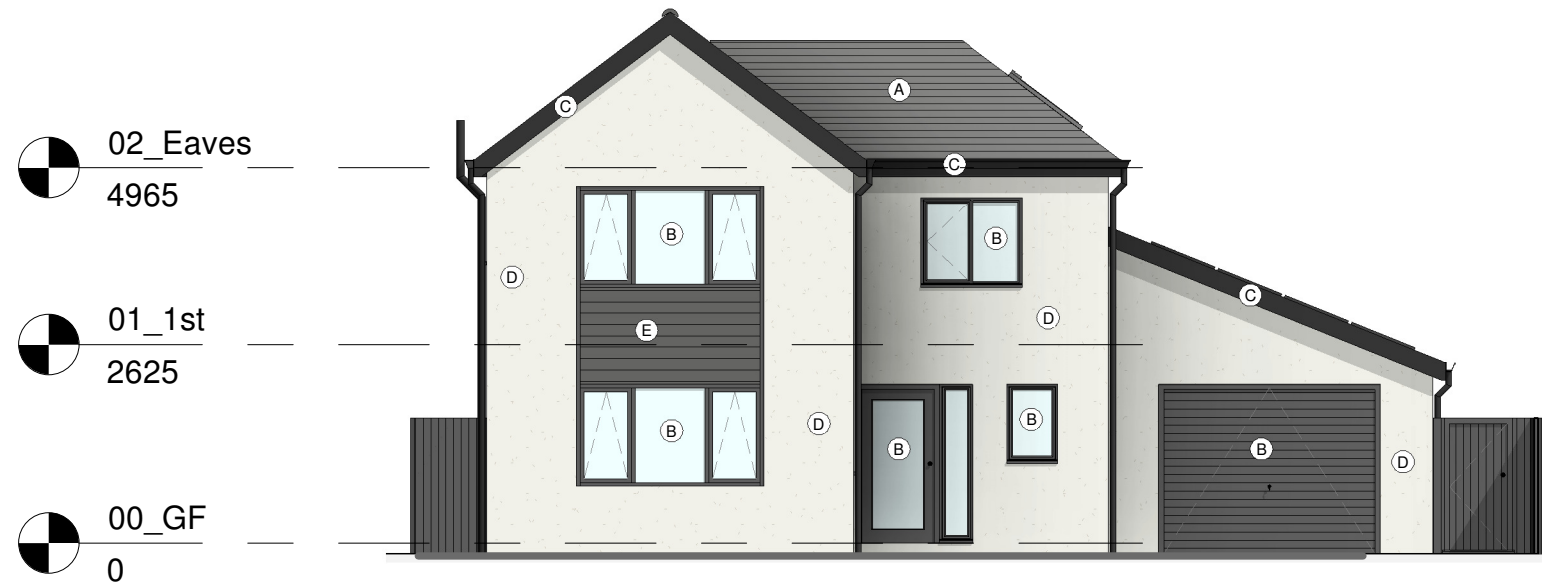
North West (Front) Elevation 1 : 100