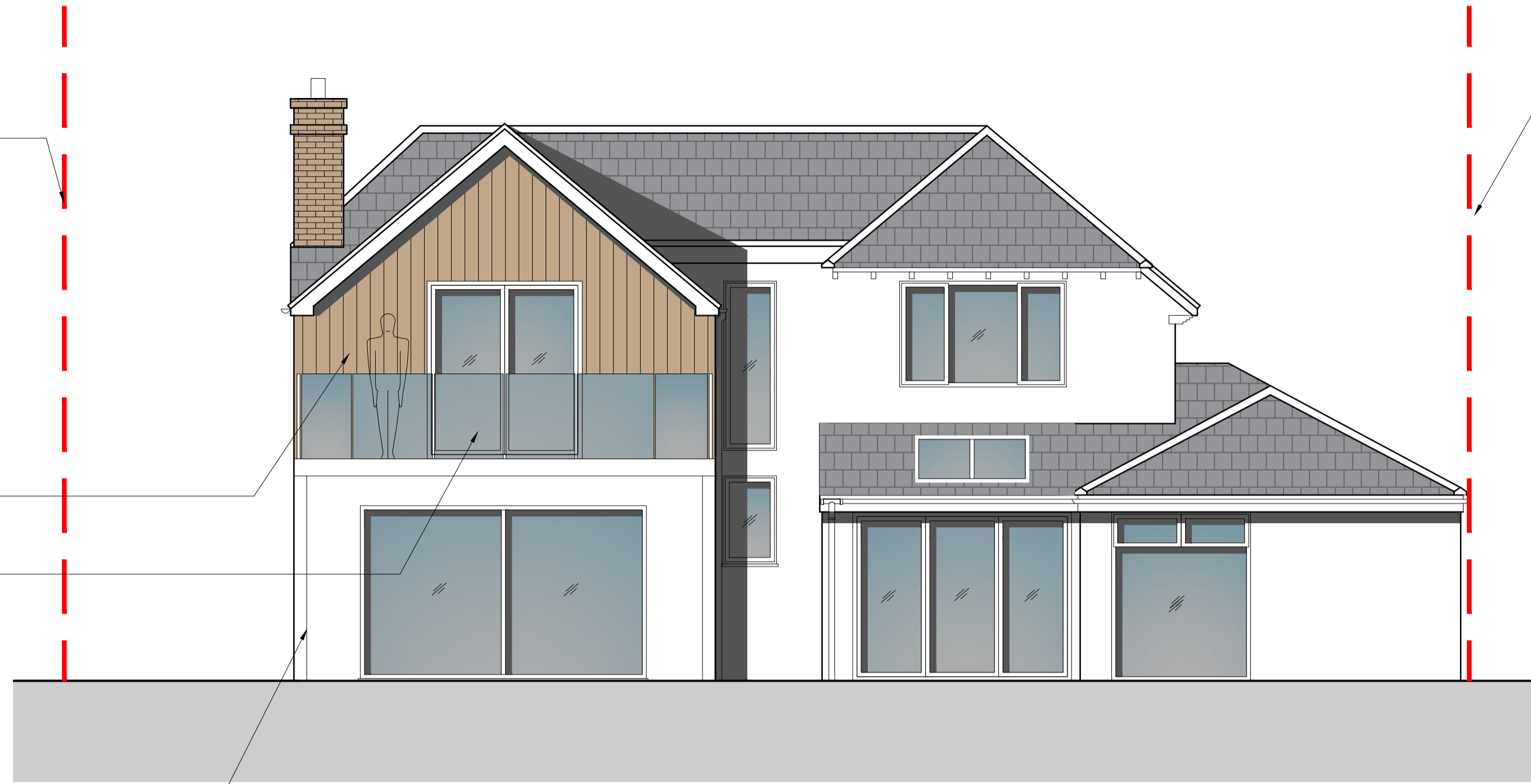
PROPOSED REAR ELEVATIONS Scale 1:50@A1

New steel posts to be installed with new balcony above, all in accordance to structural engineer's design and specifications.