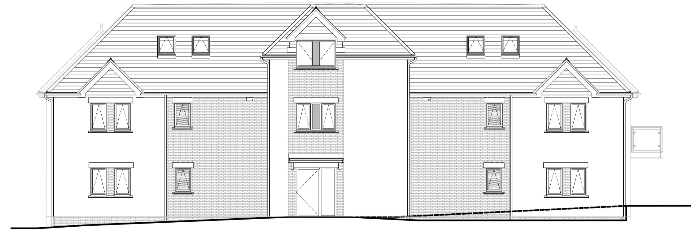
Rear Elevation (Unchanged) - 1:100