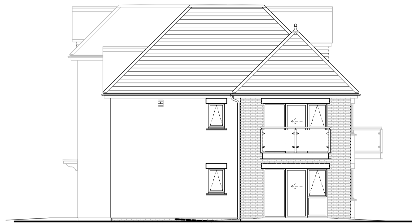
Side Elevation (Unchanged) - 1:100