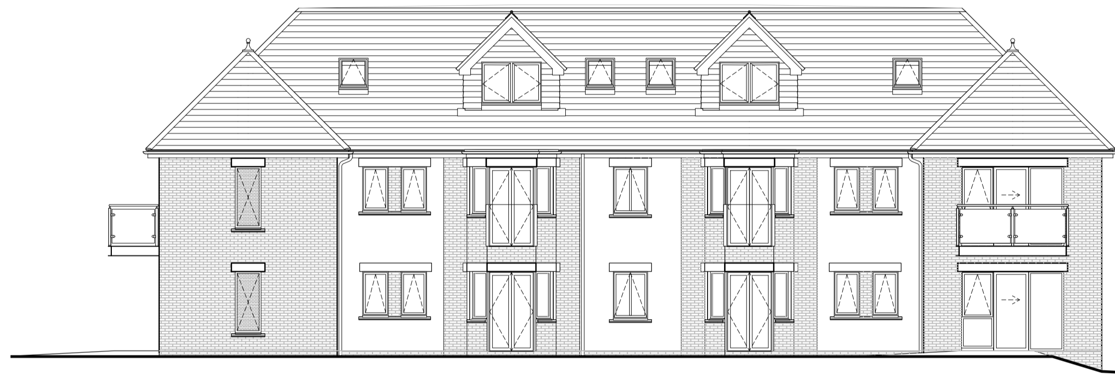
Front Elevation (Unchanged) - 1:100