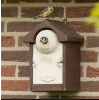
Standard Bird Box