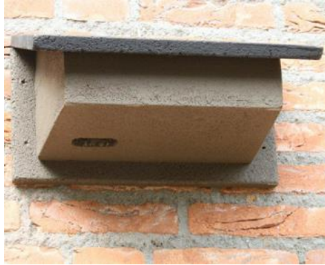
Swallow Type Bird Box