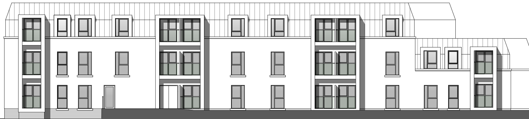
Elevation to Parking ( North East Facing )