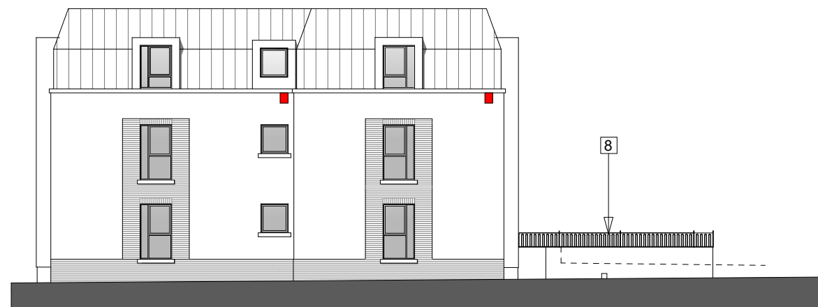
Elevation to Kelvedon Street ( South East Facing )