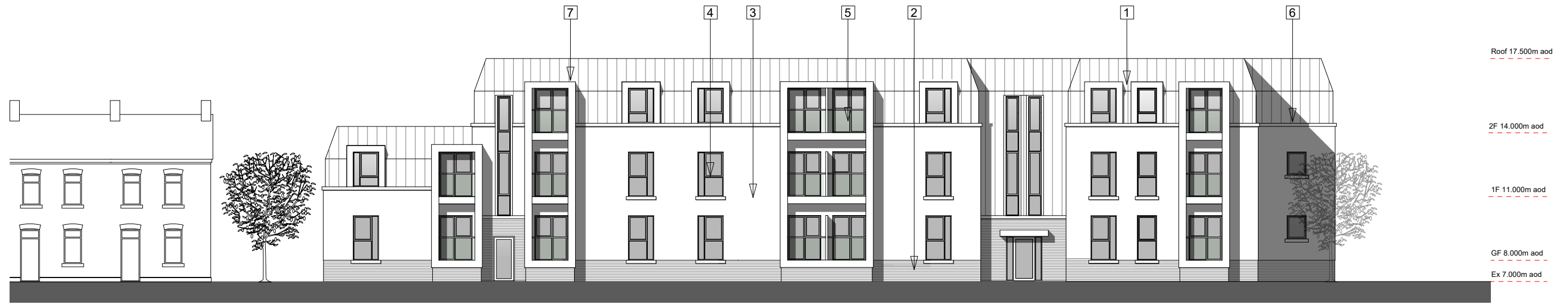
Elevation to Feering Street ( South West Facing )