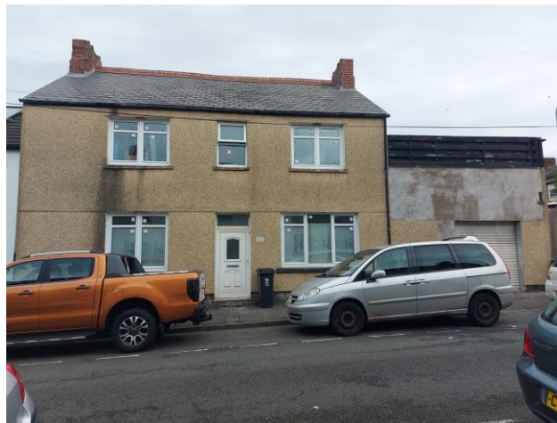
Plate 1 – Front Elevation

Work did commence; however, this application reflects the reconsideration that has been given to the approved scheme and incorporates improvements.