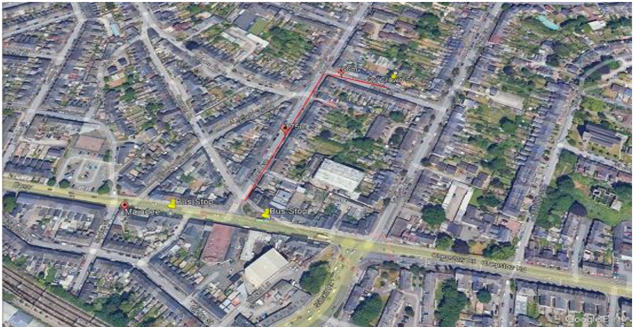
Plate 3 - Aerial View showing bus stops

It is not considered necessary to provide any additional off-street parking because of the limitations of 1 person per room and the similarity of the current lawful use being 4 student bedrooms and a self-contained flat.