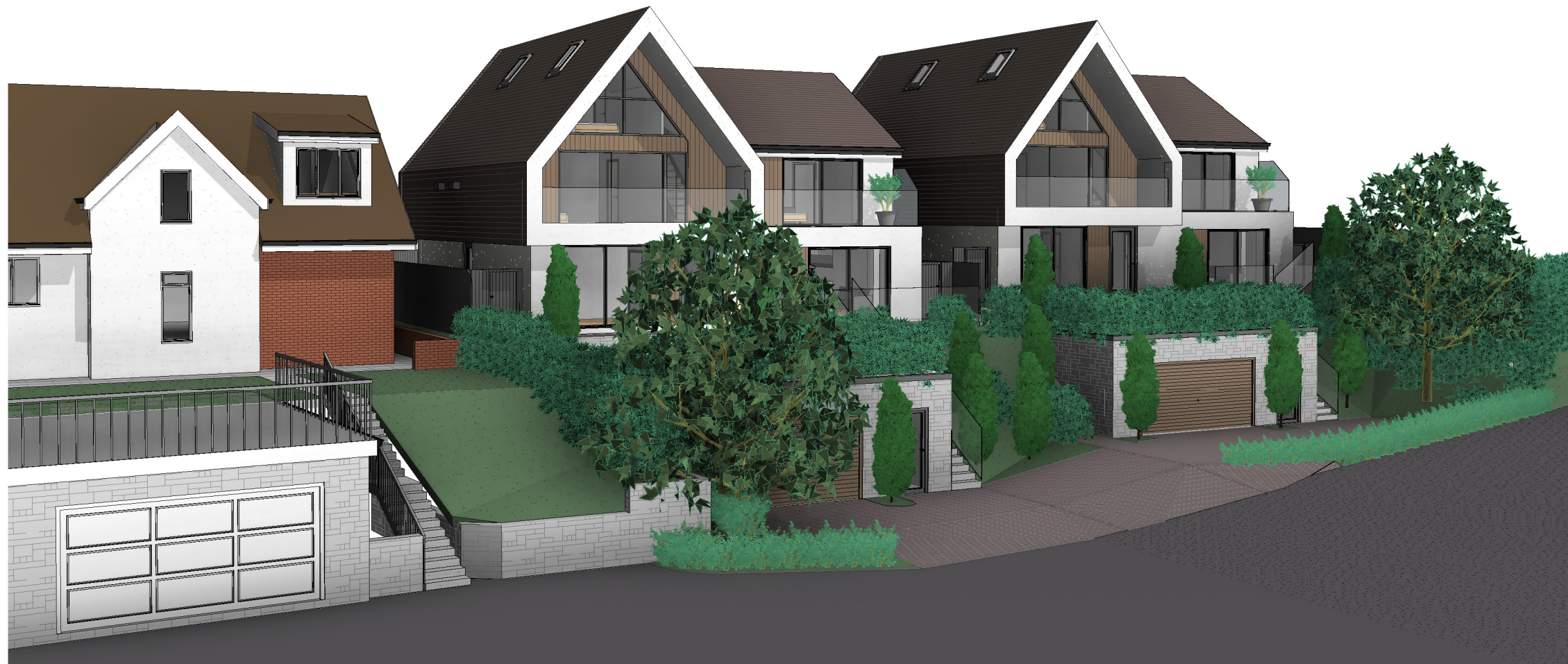
North East Perspective View

For Landscaping Design refer to Landarb Solutions design proposals