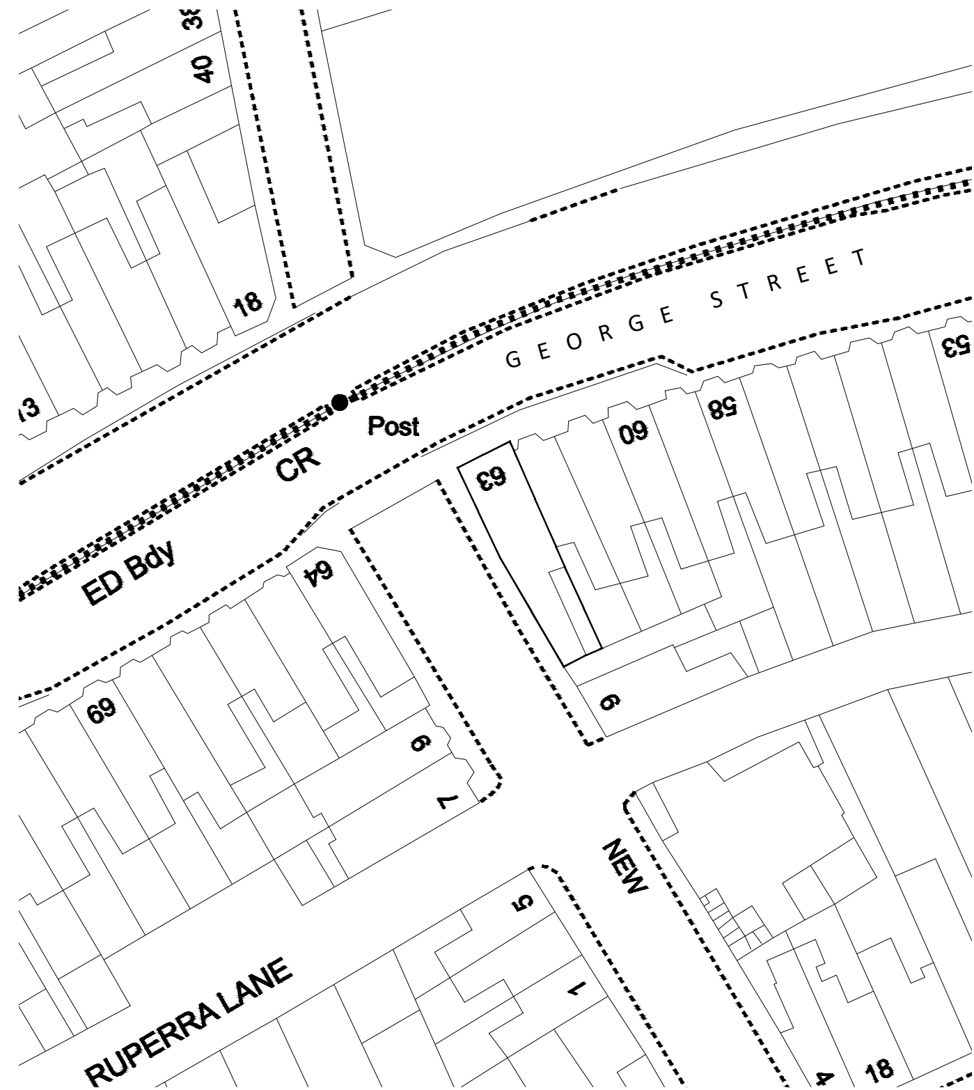
BLOCK PLAN Scale 1:500@A3