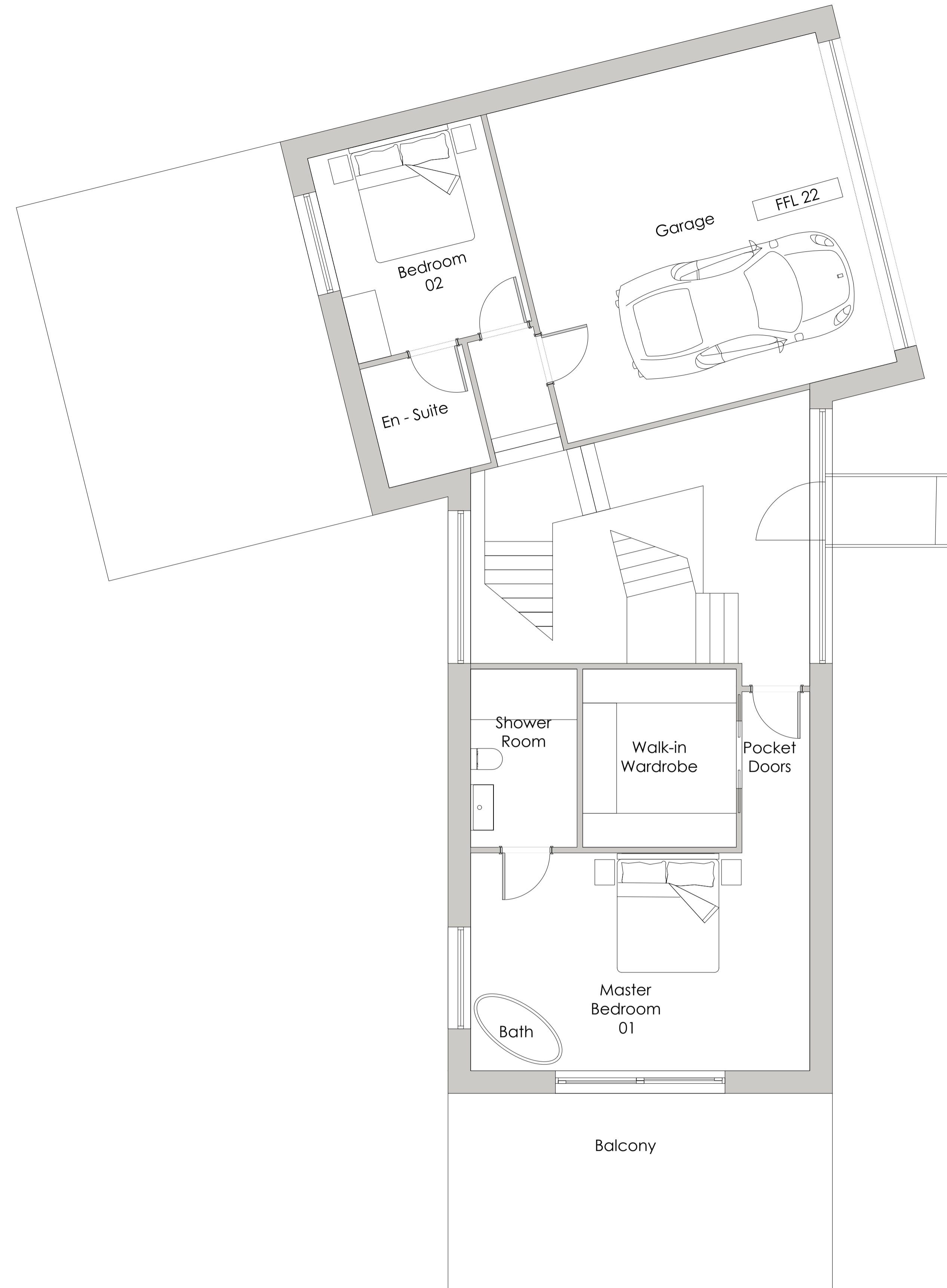
GROUND FLOOR PLAN Gross Internal Area - 118 m 2