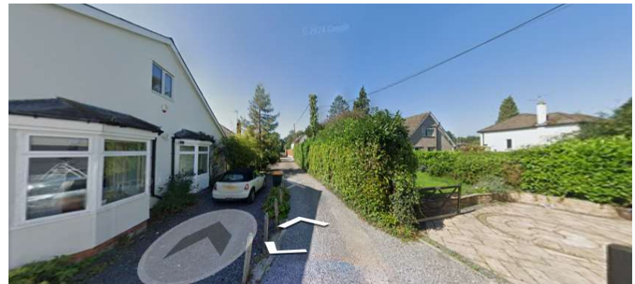
Image of existing streetscene

The application site is situated within an established urban residential area where the surrounding area is characterised by residential dwellings typical of a built-up area, with a wide variety of individual vernacular styles and appearances. Surrounding properties typically comprise of brick, render and cladding. Roof forms are predominantly pitched with hips or gables having a tiled finish. Dwellings within the enclave are arranged in a cul-de-sac settlement pattern.