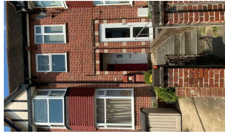
Image of Front Elevation