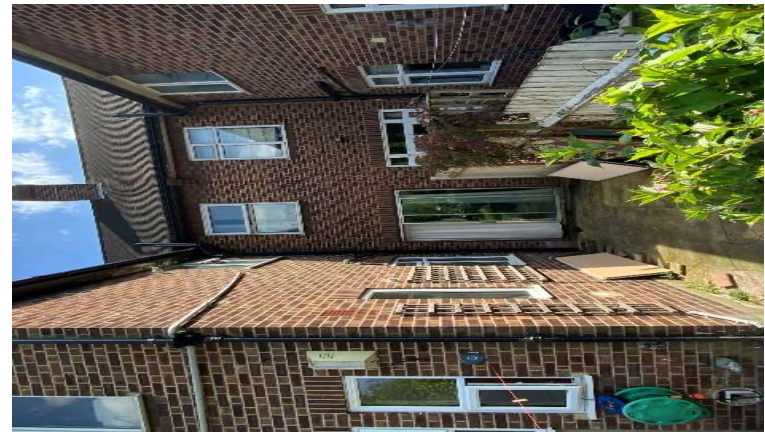
Image of Rear Elevation