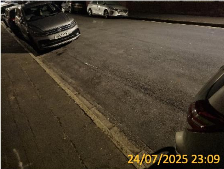
Rugby Road – North Side