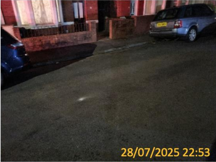
Bedford Road – South Side