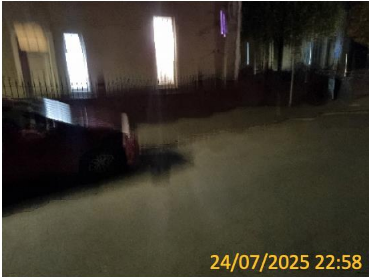
Cedar Road – West Side