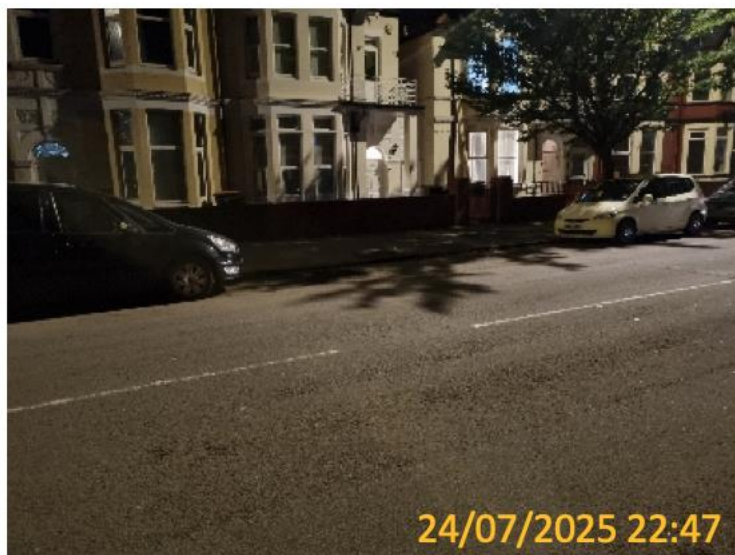
Corporation Road – North Side