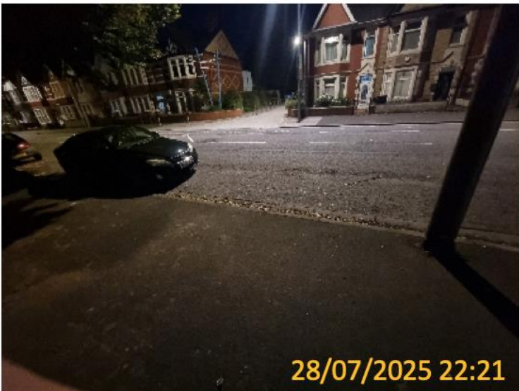
Corporation Road – North Side