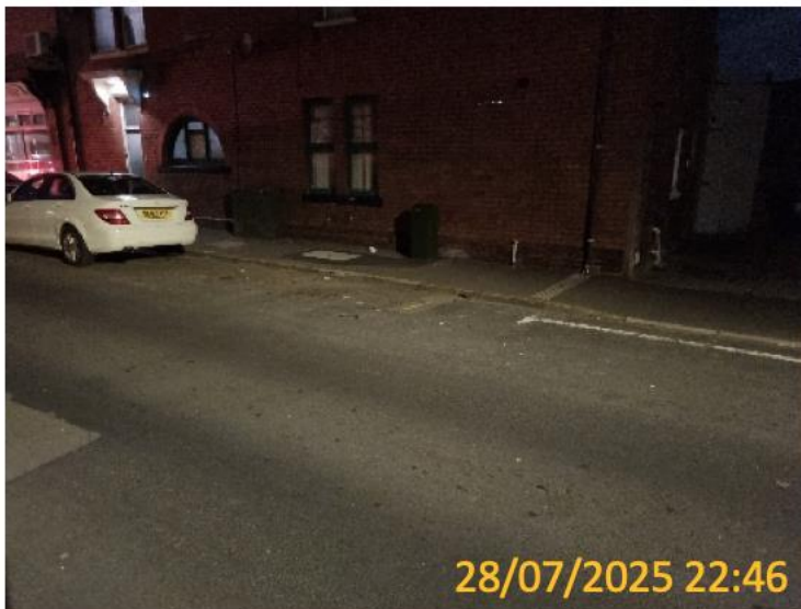
Harrow Road – North Side