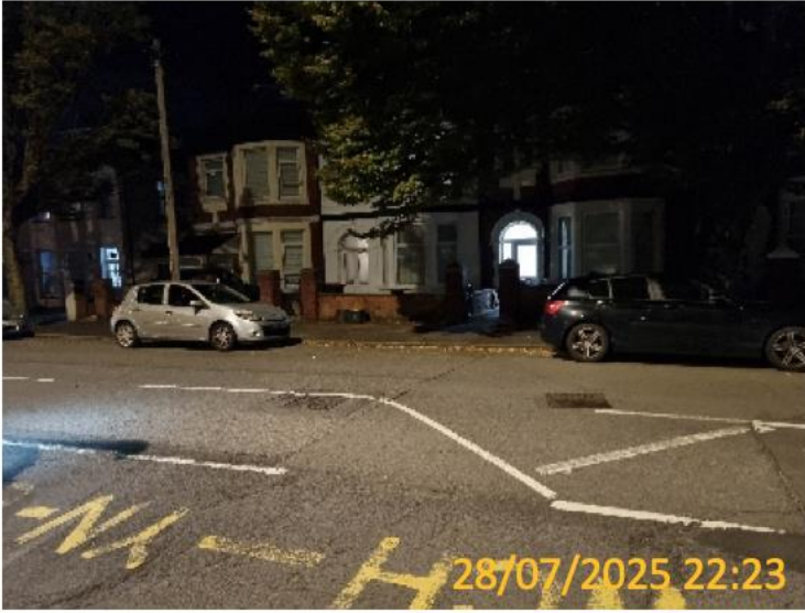
Corporation Road – North Side