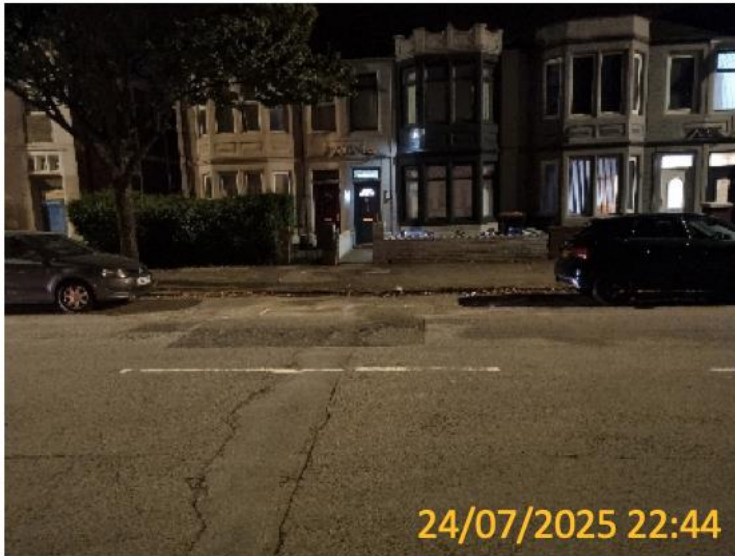
Corporation Road – South Side