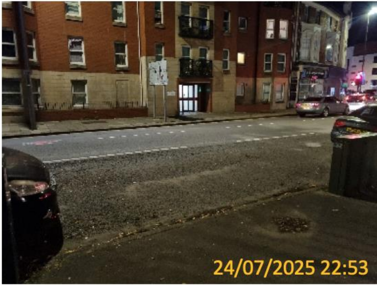
Corporation Road – North Side