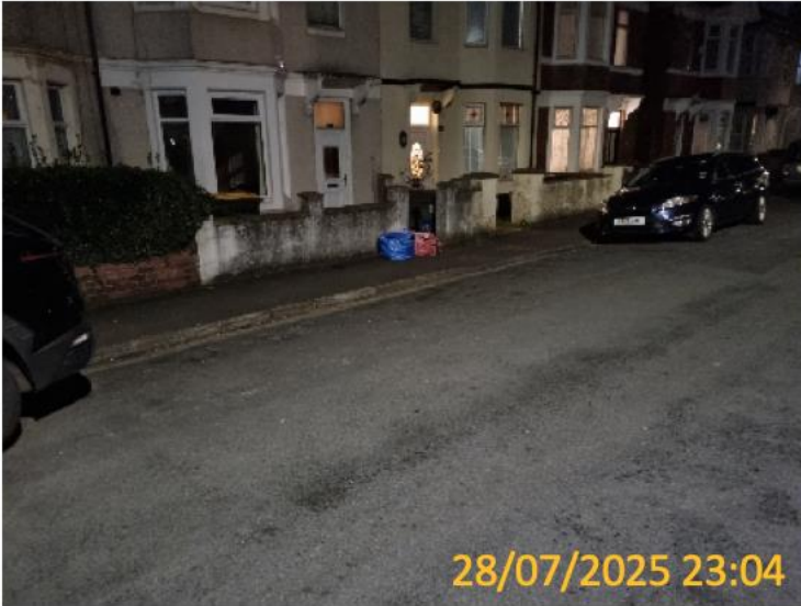
Rugby Road – South Side