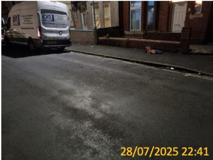
Bedford Road – North Side