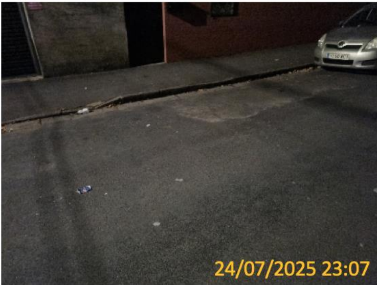
Harrow Road – North Side