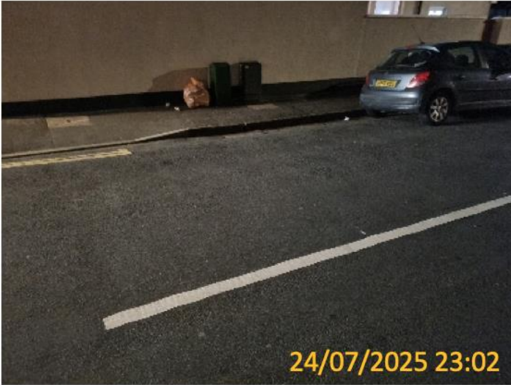
Bedford Road – North Side