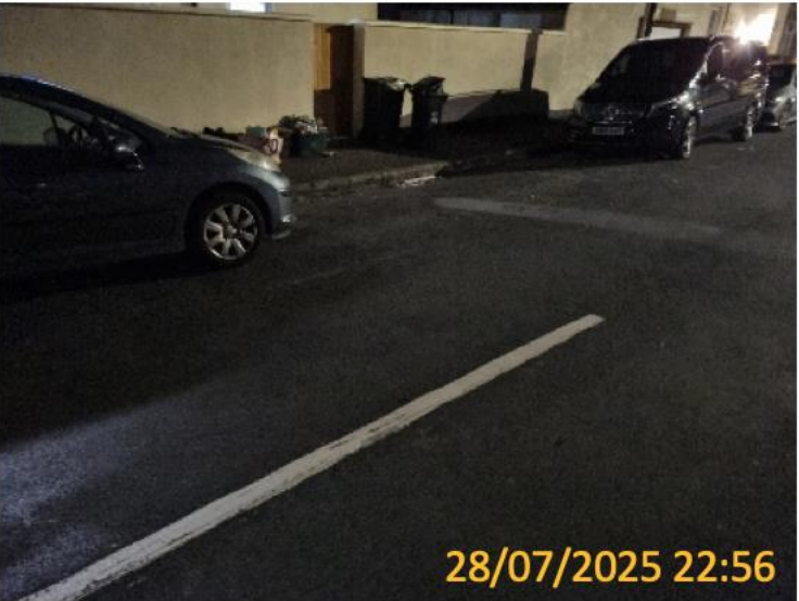
Bedford Road – North Side