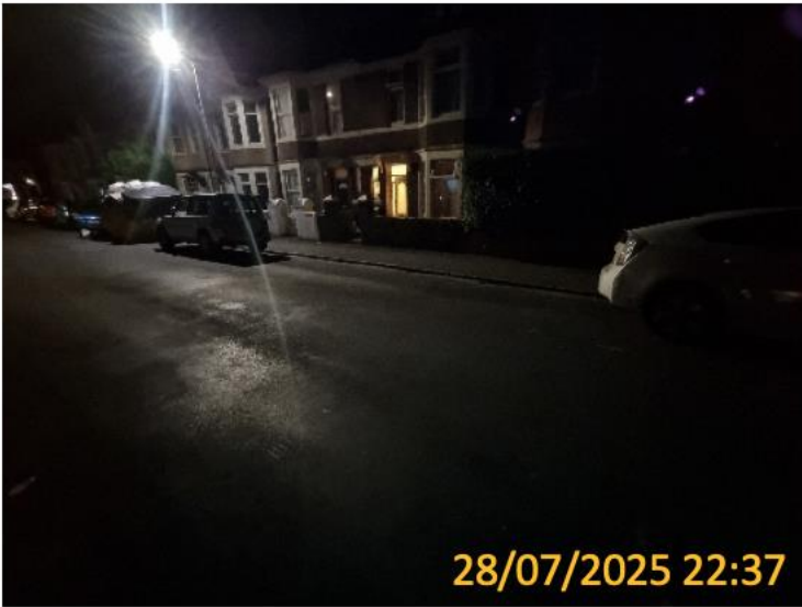
Harrow Road – South Side