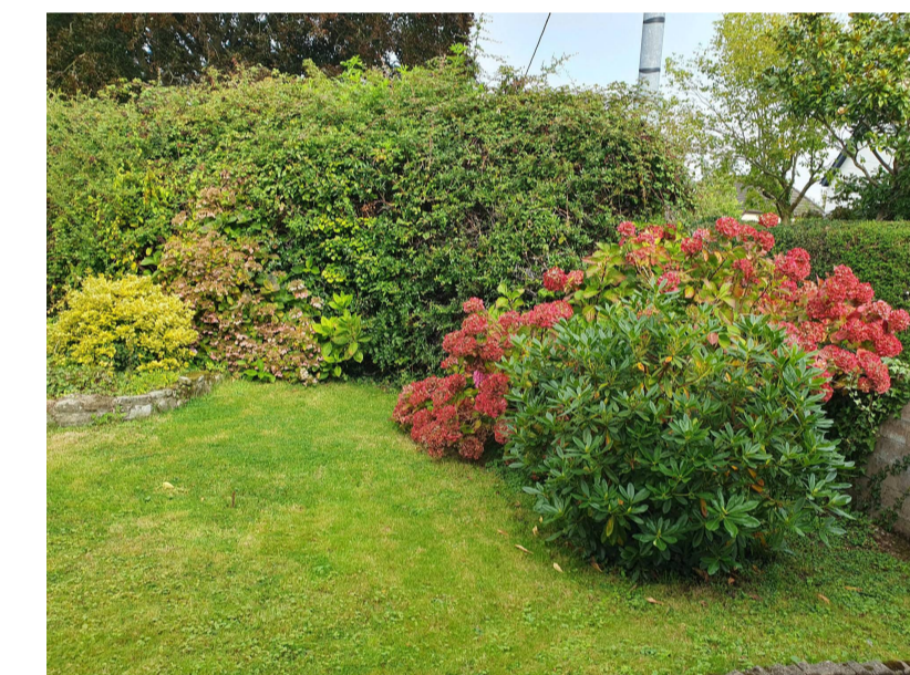
EB2 Hydrangea & EB3 Rhododendron