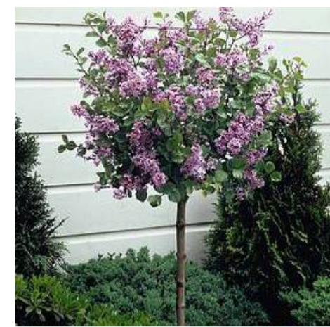
PT3 Syringa Palibin