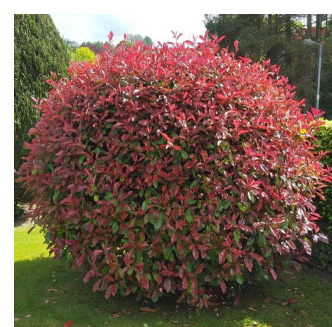
PT1 Photinia 'Red Robin'