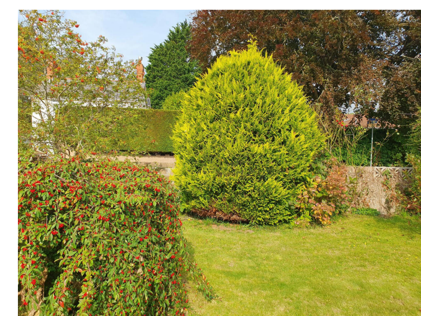
ET3 Rowan 'Sorbus aucuparia' (rear left), ET2 Thuga occidentalis 'Arborvitae' (centre), EB4 Cotoneaster coriaceous (foreground left), PT1 Photinia 'Red Robin', sapling to right - grown to 3.5-4m