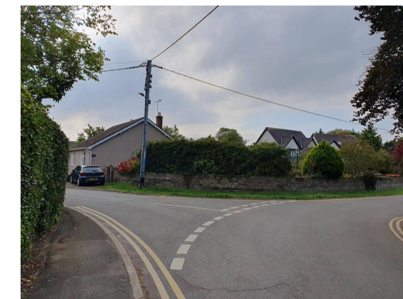
View 1 showing existing high level mature screening at boundary