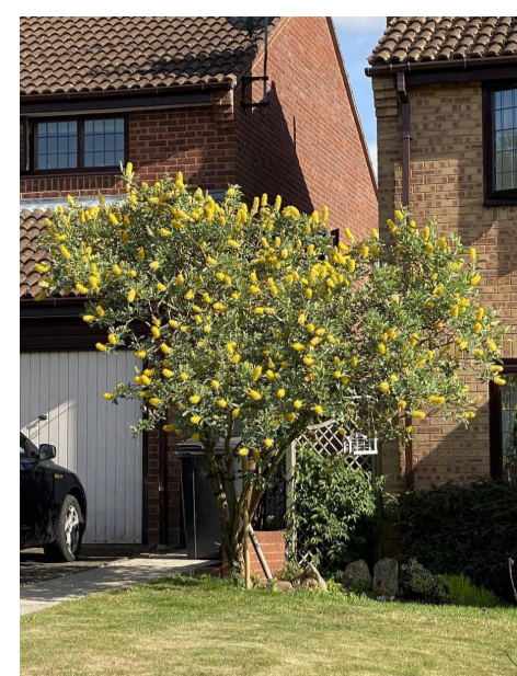
PT4 - Citrus battandieri (example)