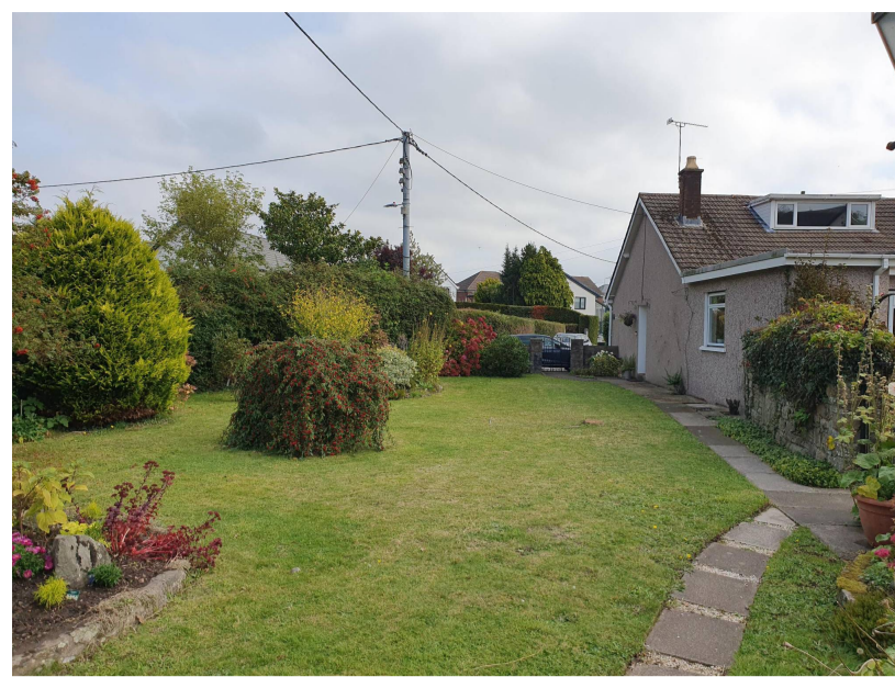
View 2 showing existing garden area. Existing planting not affected