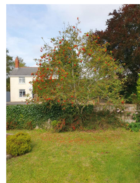
ET3 - Rowan 'Sorbus aucuparia'