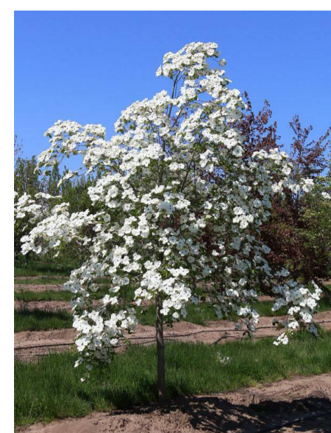
PT2 Cornus 'Eddies White Wonder'