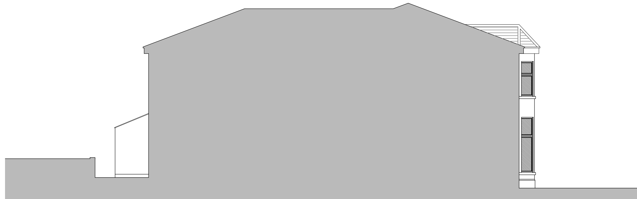
EXISTING SIDE ELEVATION 1:100 @ A3