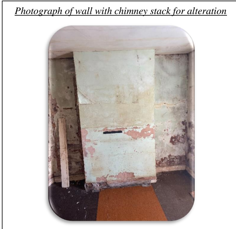
Photograph of wall with chimney stack for alteration