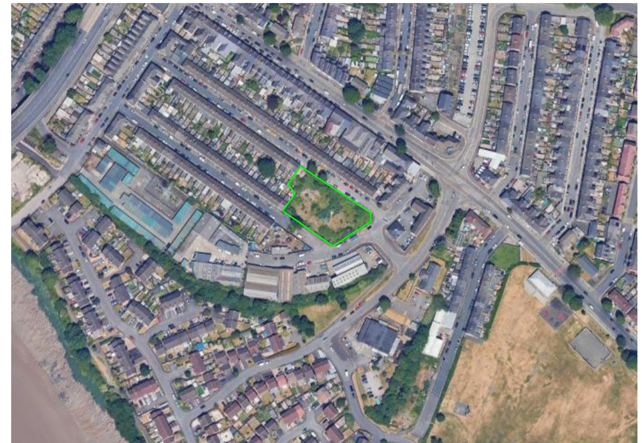
Aerial view of site (NTS) site boundary for information only

SITE ADDRESS: 21 Kelvedon Street, Newport Gwent, NP19 0DW,