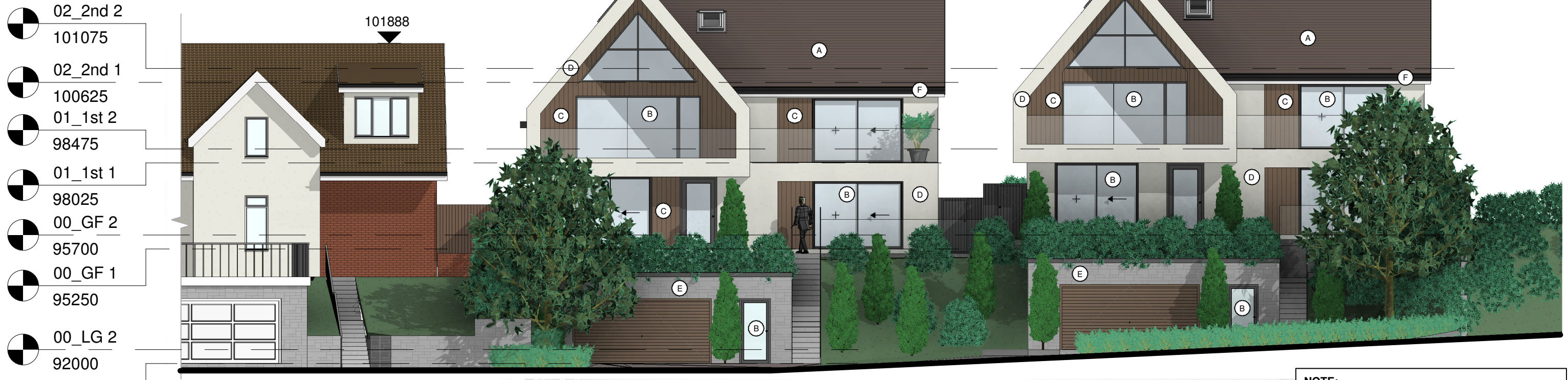
North (Front) Elevation 1 : 125