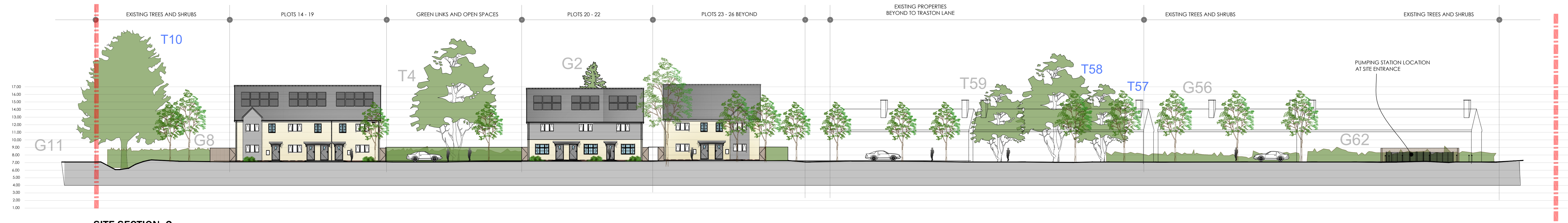
SITE SECTION 2