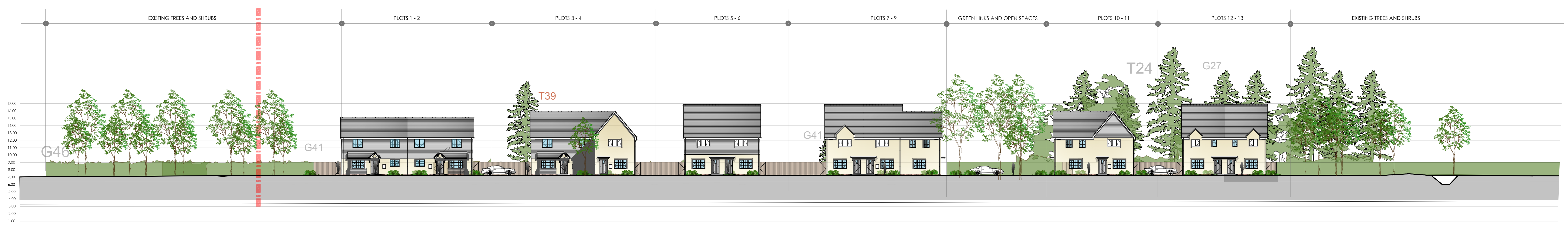
SITE SECTION 1

Do not scale from this drawing. The user of this drawing must check all dimensions and details against the original drawings and specifications. This drawing is copyright. It must not be reproduced, stored in a retrieval system, or transmitted in any form or by any means, without prior permission of the author.