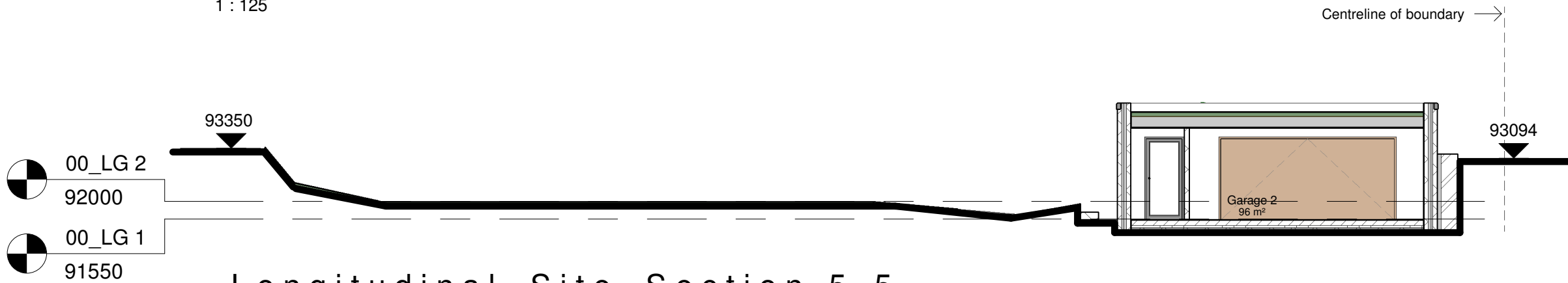
Longitudinal Site Section 5-5