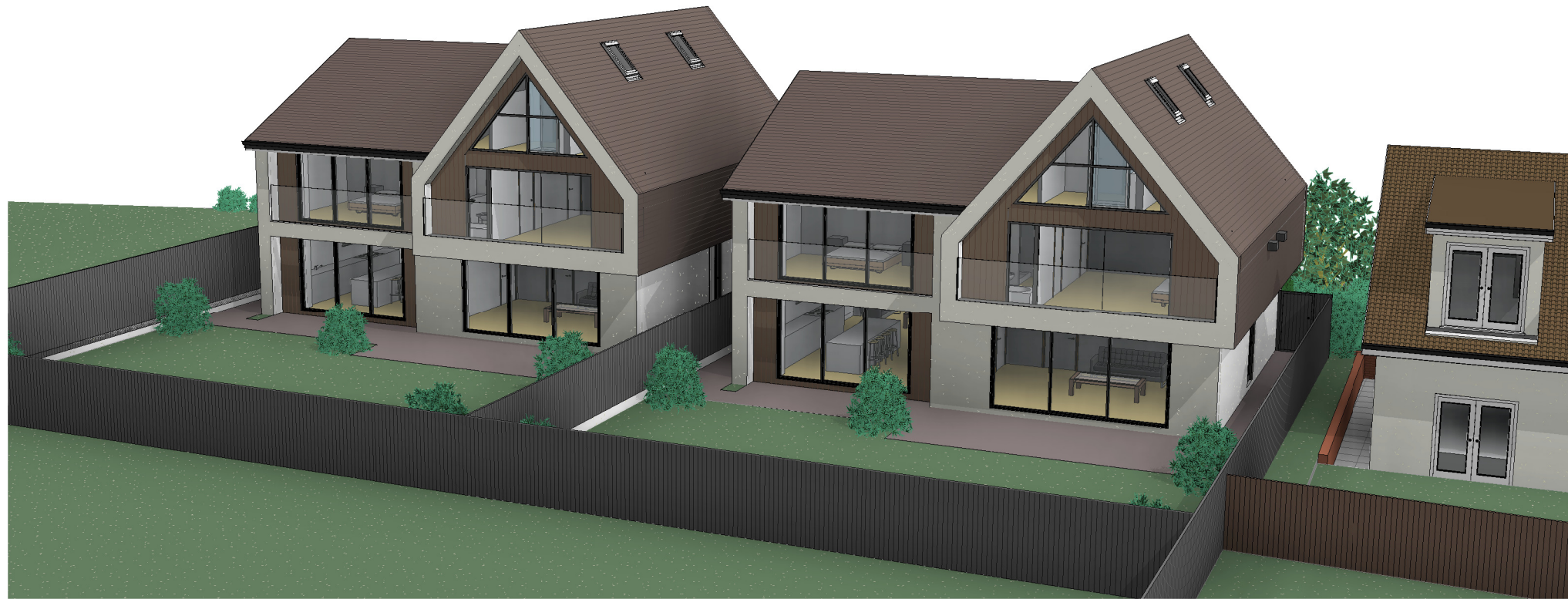
South East Perspective View