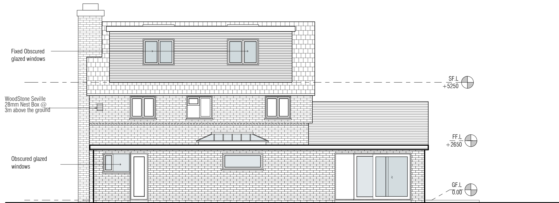
PROPOSED ELEVATION C