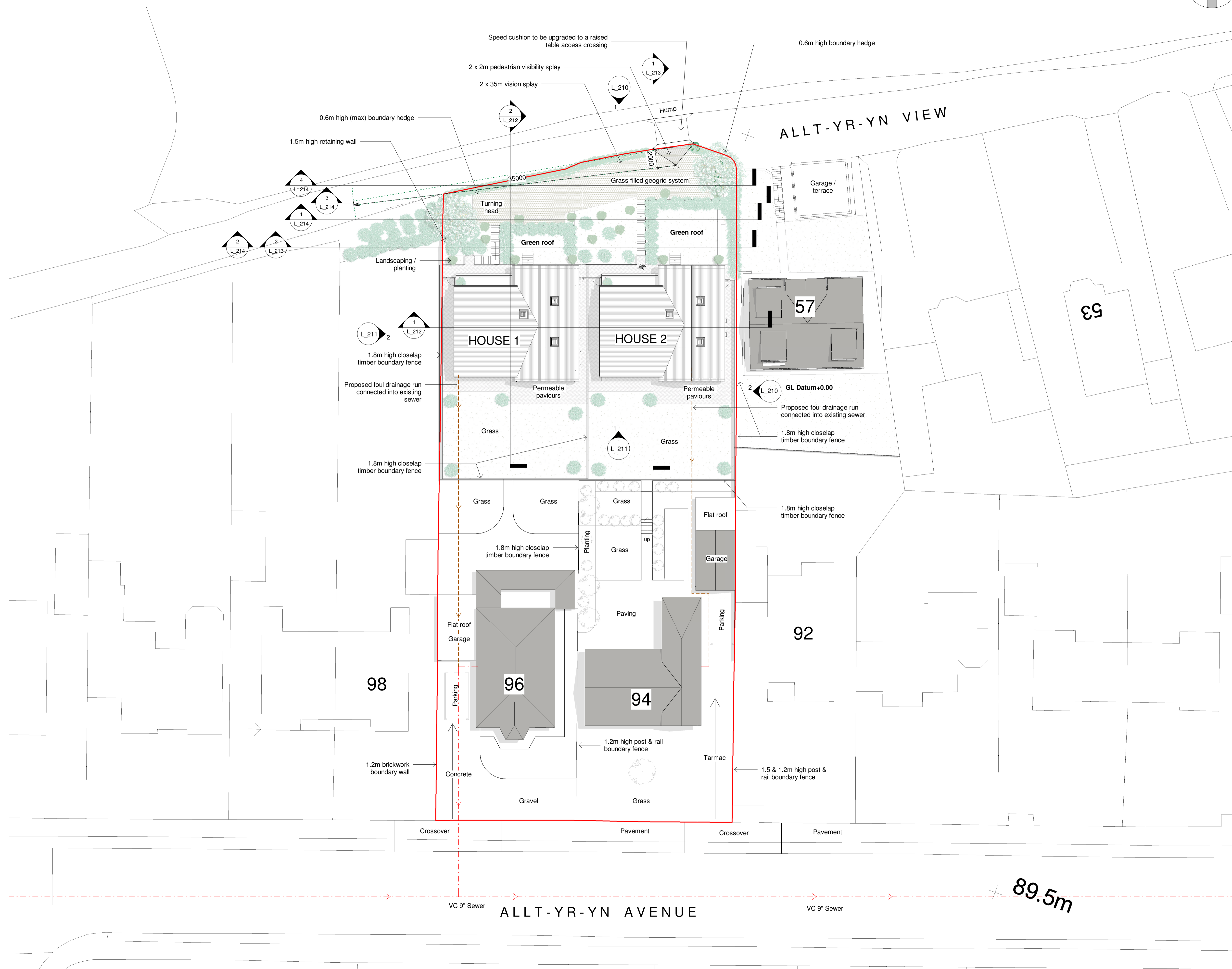
Site Plan as Proposed 1 : 200

DRAINAGE NOTE: Refer to Bear Structures Information for SAB & Drainage