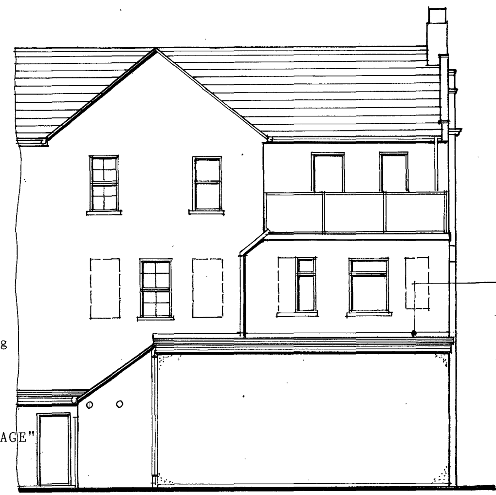
Proposed rear elevation SCALE 1:100 PROPOSED FINISHES ETC ROOF Dark grey waterproof GRP WALLS Painted waterproof render over facing brick plinths DOORS Standard external fire escape door