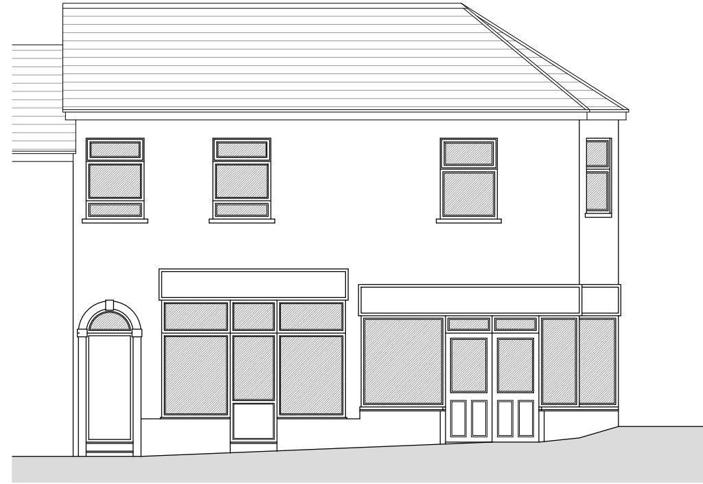
EXISTING FRONT ELEVATION 1:100 @ A3