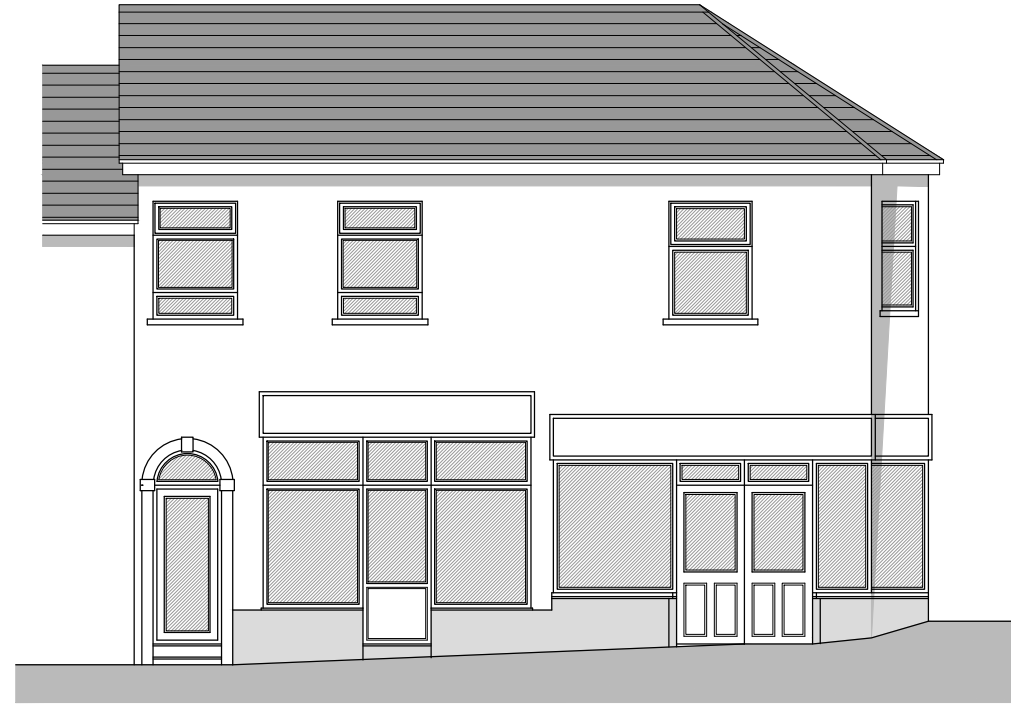
PROPOSED FRONT ELEVATION 1:100 @ A3