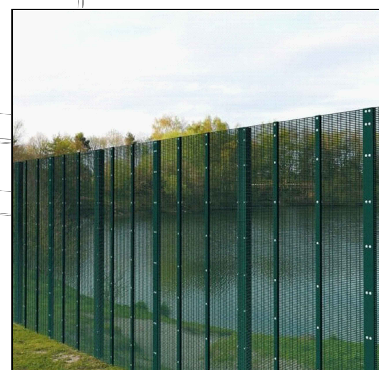
TYPICAL FENCE IMAGE (PROPOSED IN BLACK)