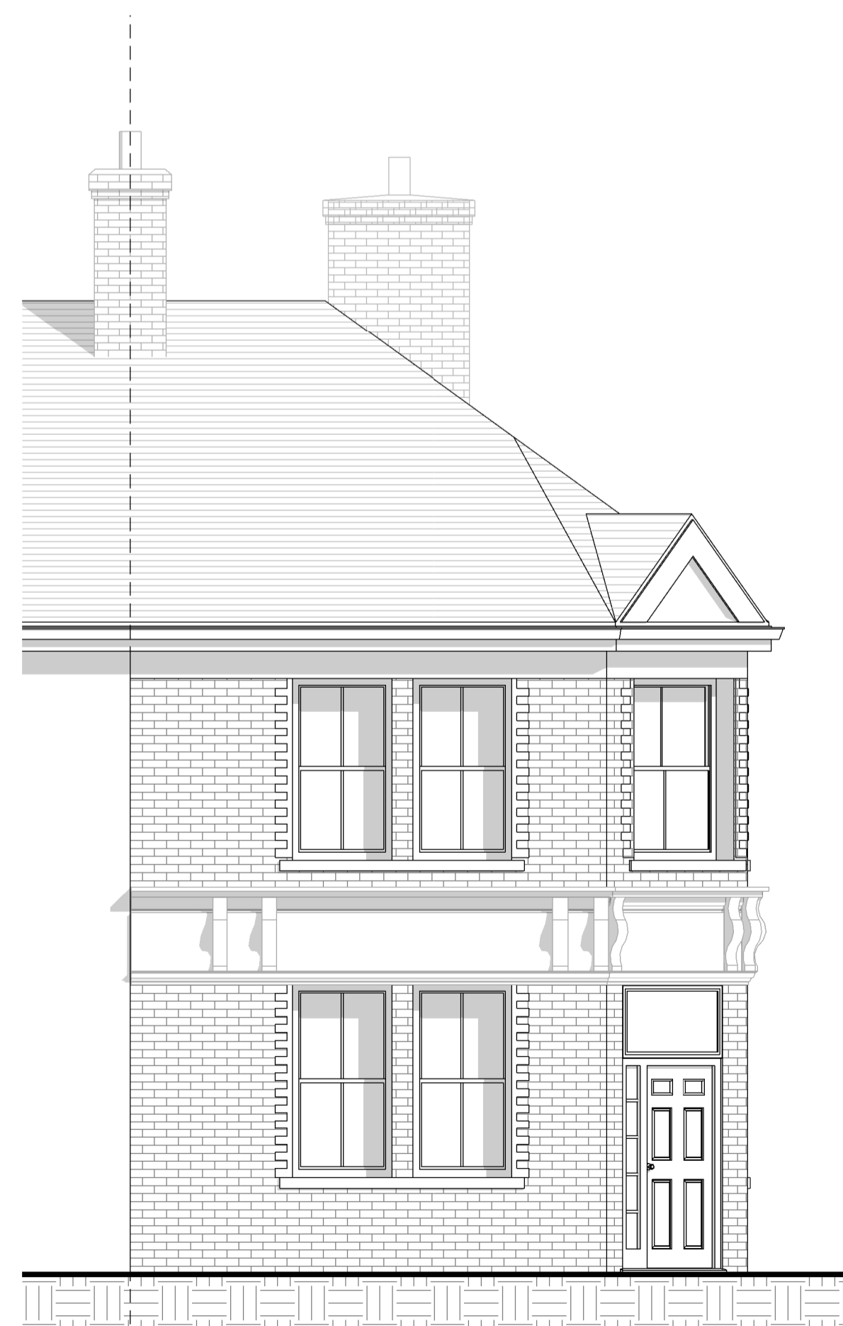
4 Proposed Front Elevation(CourtybeHa Terrace) 1:50