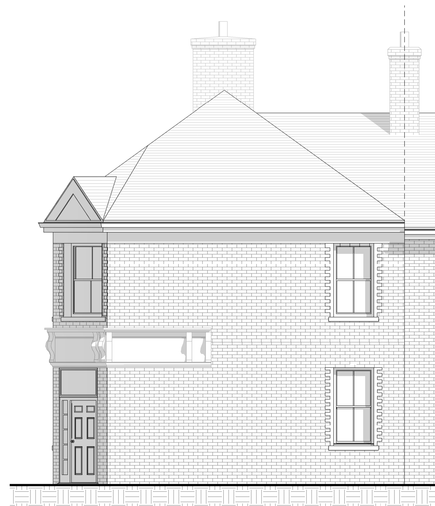
5 Proposed Side Elevation(Baldwin Street) 1:50