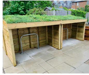
External bicycle store - 1m deep x 3.1m long (8 bikes) x 1.5m high with Sheffield stands & sedum roof

All new landscaping planting shown; including all shrubs, trees and hedge planting shall be maintained free from weeds and shall be protected from damage by vermin and stock. Any trees or plants which, within a period of five years, die, are removed, or become seriously damaged or diseased shall be replaced in the next planting season with others of a similar size and species, unless otherwise agreed in writing by the local planning authority.